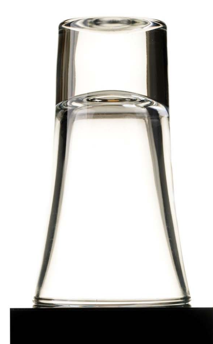
No Hidden Fees