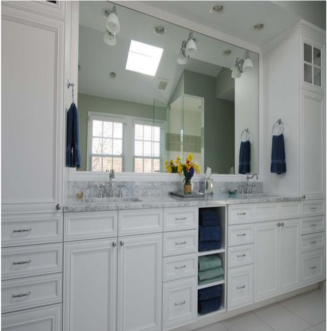
Figure 2: Example of an upscale bathroom remodel

A final deduction that can be drawn from the Cost vs. Value Report is that the average square footage price for a mid-range bathroom remodel is approximately $635/square foot and $650/ square foot for an upscale bathroom remodel.