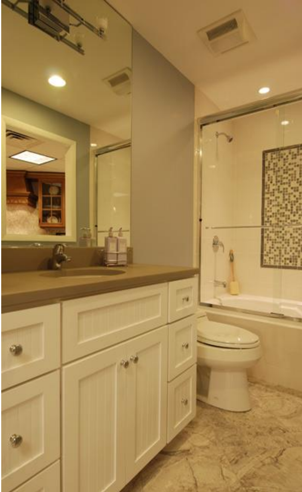
Figure 1: Example of a mid-range bathroom remodel