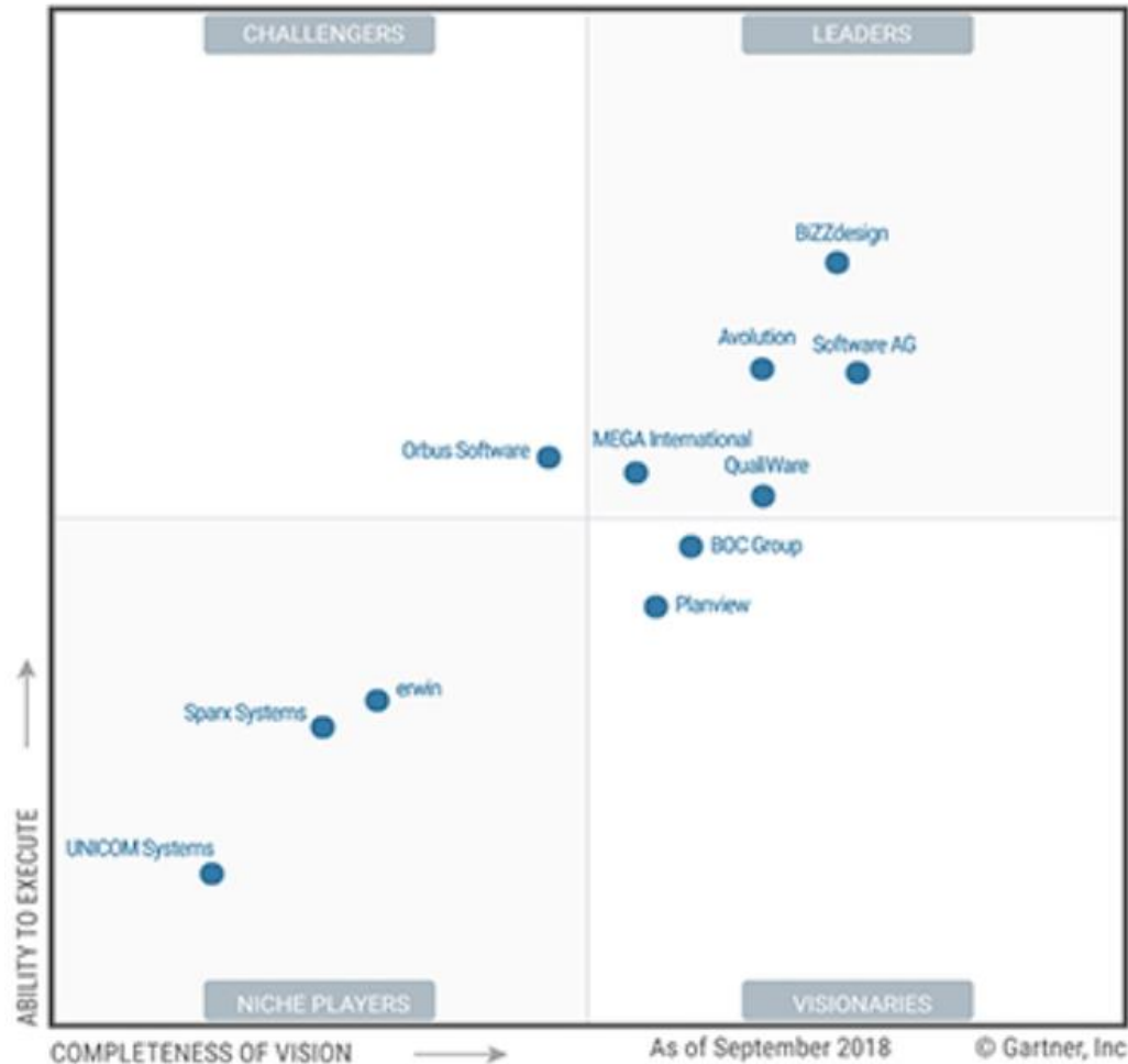
Figure 1. Magic Quadrant for Enterprise Architecture Tools