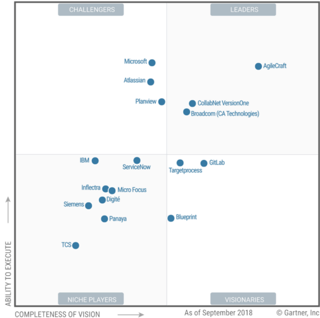
Figure 1. Magic Quadrant for Enterprise Agile Planning Tools