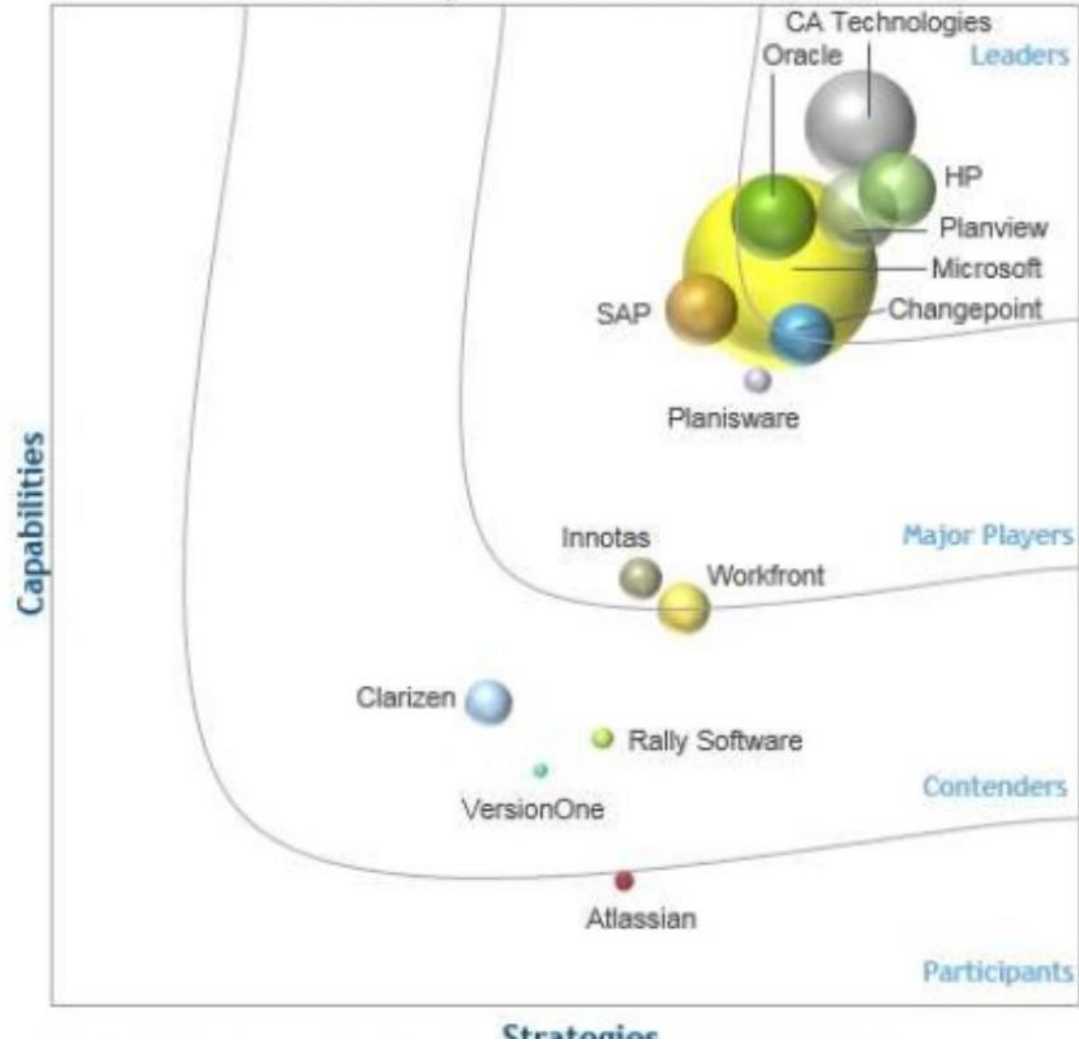
IDC MarketScape Worldwide Enterprise IT PPM