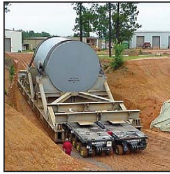
Low-level Radioactive Waste Facility

BBJ Group provided the South Carolina Budget and Control Board with a long-term care site model evaluation of the LLRW disposal facility. Work included a 100-year closure period extended care cost development; comparative analysis for currently operating, closed, or planned LLRW disposal facilities in other states; and alternative financing and implementation scenarios for closure. Findings were presented to South Carolina's Nuclear Advisory Commission.