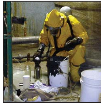
Electronics Manufacturing Company

BBJ Group provided the South Carolina Budget and Control Board with a long-term care site model evaluation of the LLRW disposal facility. Work included a 100-year closure period extended care cost development; comparative analysis for currently operating, closed, or planned LLRW disposal facilities in other states; and alternative financing and implementation scenarios for closure. Findings were presented to South Carolina's Nuclear Advisory Commission.