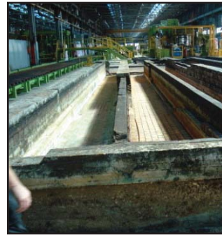
Copper Tube Manufacturer

Provided the South Carolina Budget and Control Board with long-term care site model evaluation of the disposal facility. Work included 100-year closure period extended care cost development; comparative analysis for other currently operating, closed, or planned disposal facilities; and alternative financing and implementation scenarios for closure. Findings were presented to South Carolina's Nuclear Advisory Commission.