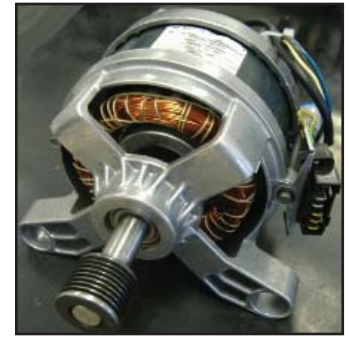
Electrical Motor Manufacturer

A Client was considering purchasing a 165-acre former copper tubing facility with confirmed chlorinated solvents and petroleum products in the subsurface. BBJ Group identified a remedial approach to address the impacted areas and provided an Opinion of Cost to remediate the property, allowing the Client to evaluate options for potential future beneficial reuse for industrial purposes.