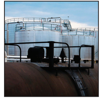
Asphalt Terminal Siting, Planning, and Permitting

BBJ Group reduced regulatory burden for a bulk terminal seeking to retrofit its facility to accept a different grade of petroleum product. Following review of product specifications and completion of an emission inventory, BBJ Group suggested modifications to facility operations that allowed the terminal to avoid triggering more onerous permitting and reporting requirements.