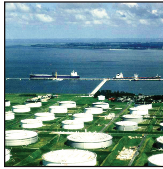
Bulk Petroleum Terminal Retrofit

BBJ Group assessed potential emissions for a global electronics manufacturer that was constructing a new facility to replace an existing facility. The company initially anticipated needing a minor source permit, but BBJ Group’s recommendations regarding process changes allowed the new facility to remain within the state’s permit-by-rule framework. This allowed the facility to come on-line earlier than anticipated.