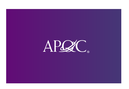
APQC MENTORING CASE STUDY WITH CARDINAL HEALTH READ MORE