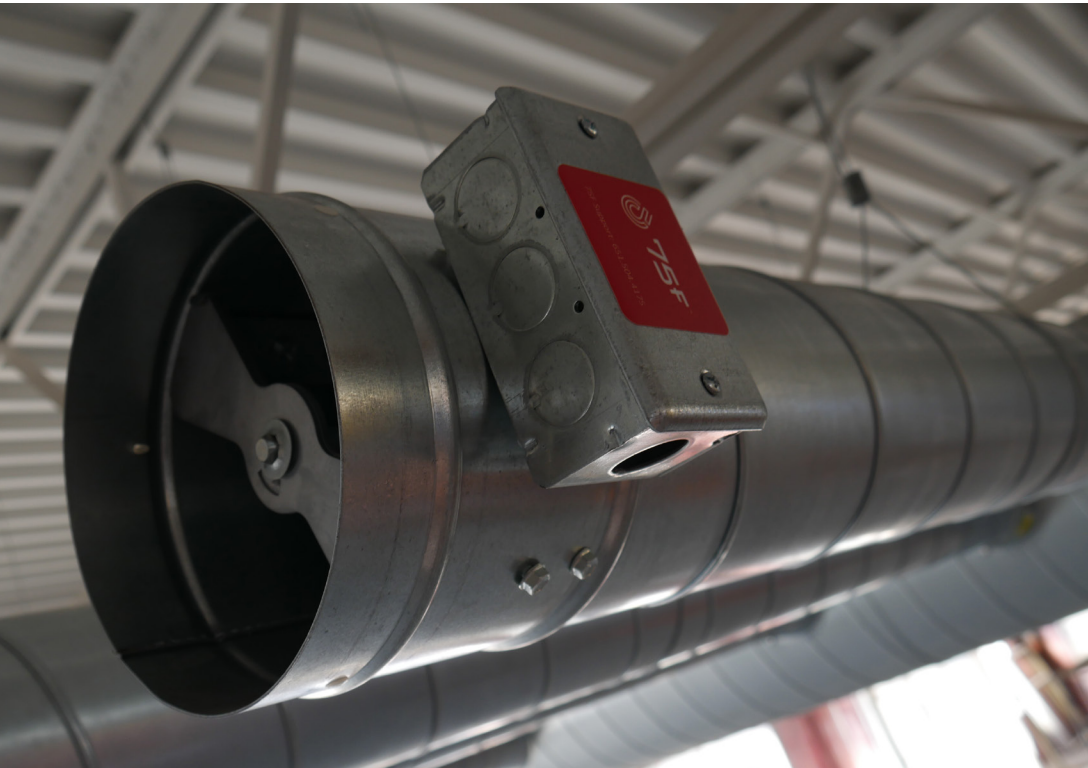
The 75F system installed in The Reserve in Edina, MN.