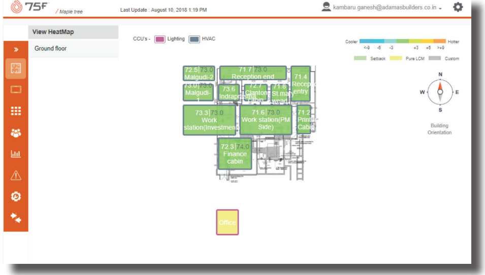
75F optimised Occupant comfort at MapleTree by dynamically balancing the airflow and controlling the chilled water flow.

75F Facilisight: With the Facilisight app, the MapleTree facility manager receives the required insights for optimum operation and preventive maintenance.