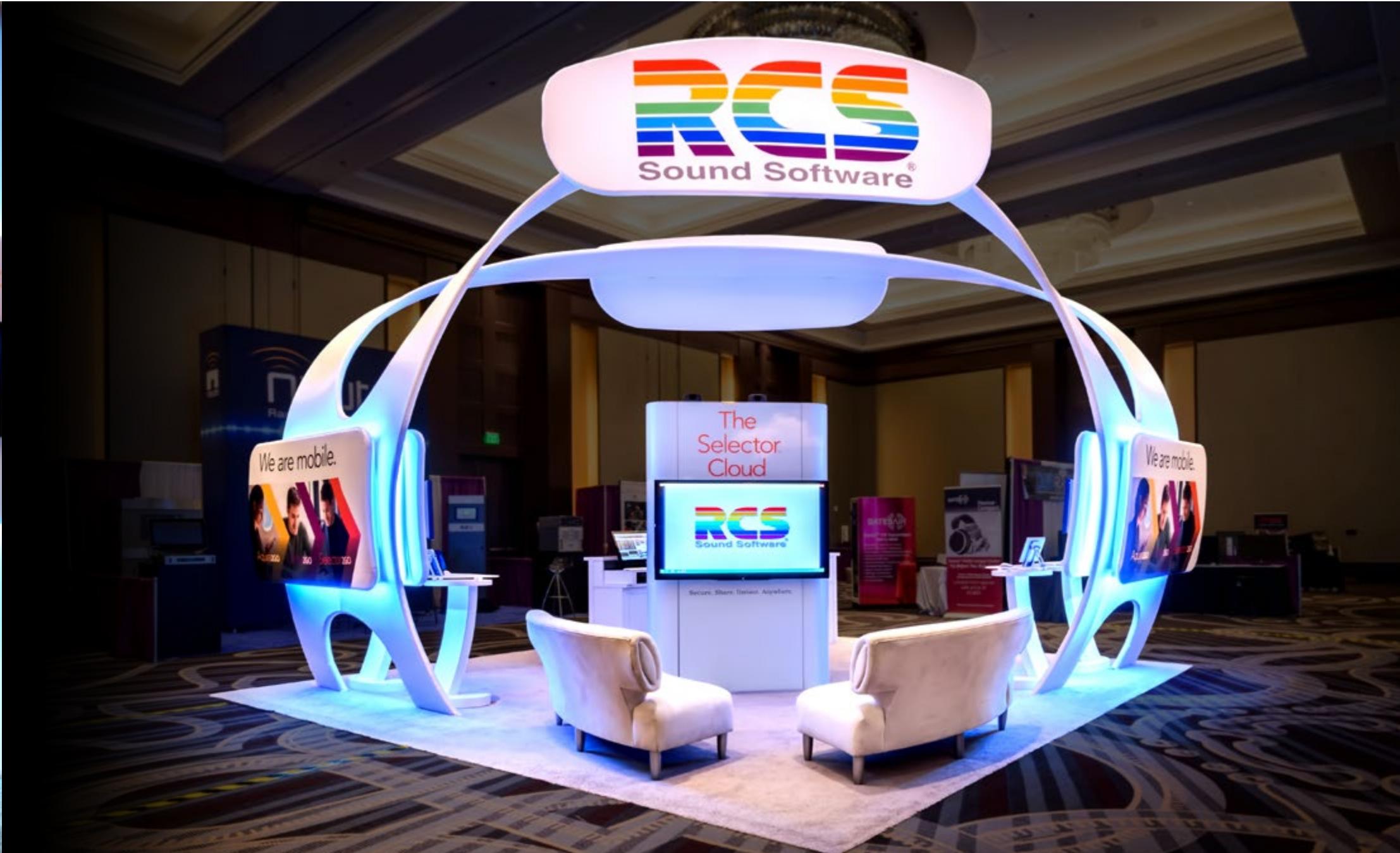
trade show RCS | NASHVILLE | 20 X 20'

EXPERTS IN THE DESIGN, PRODUCTION, AND MANAGEMENT OF BRANDED ENVIRONMENTS EXHIBITS | EVENTS | ENVIRONMENTS | MOBILE VEHICLE TOURS | MUSEUM | EXPERIENTIAL