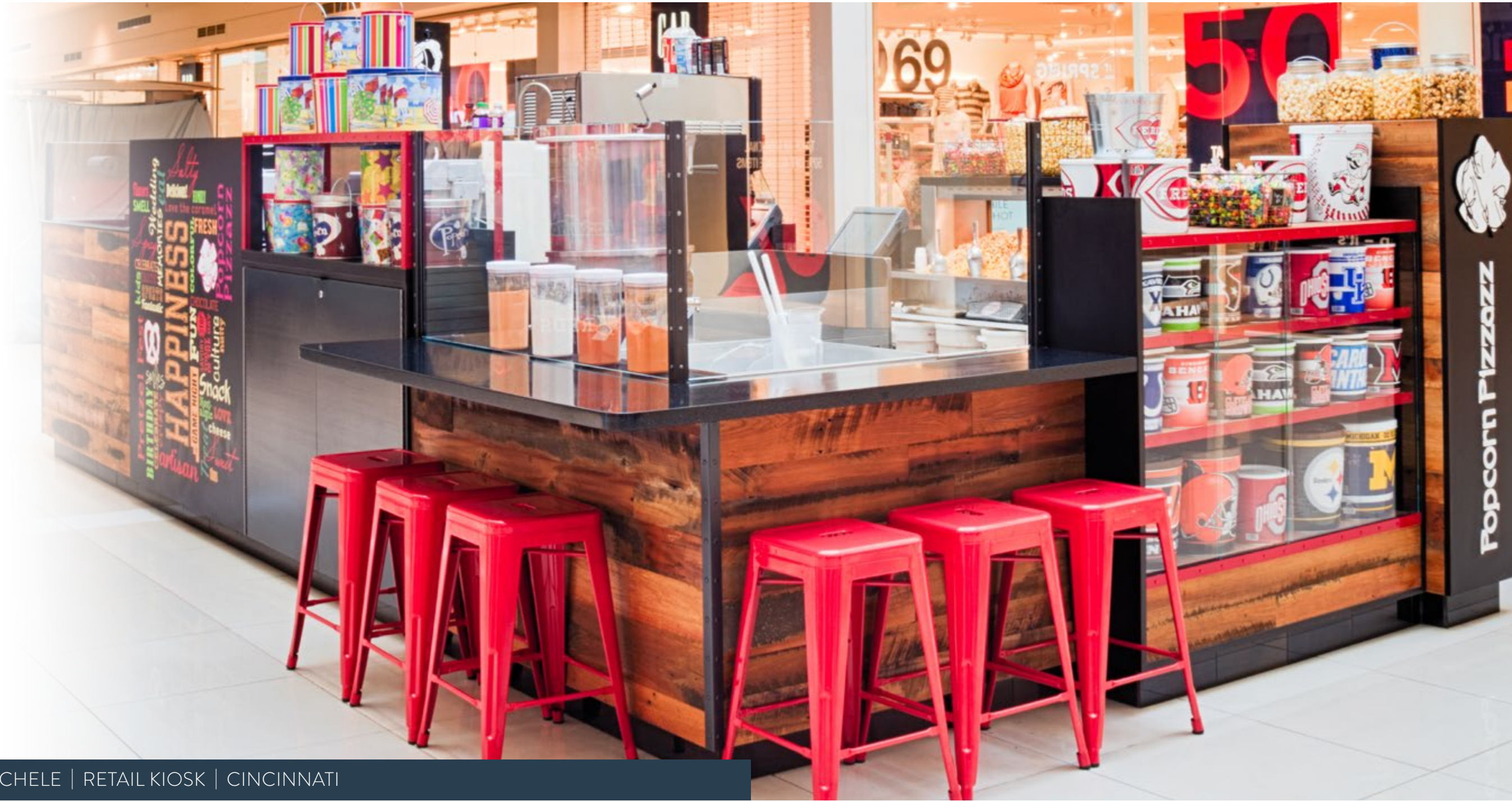
commerical interiors MAR-CHELE | RETAIL KIOSK | CINCINNATI