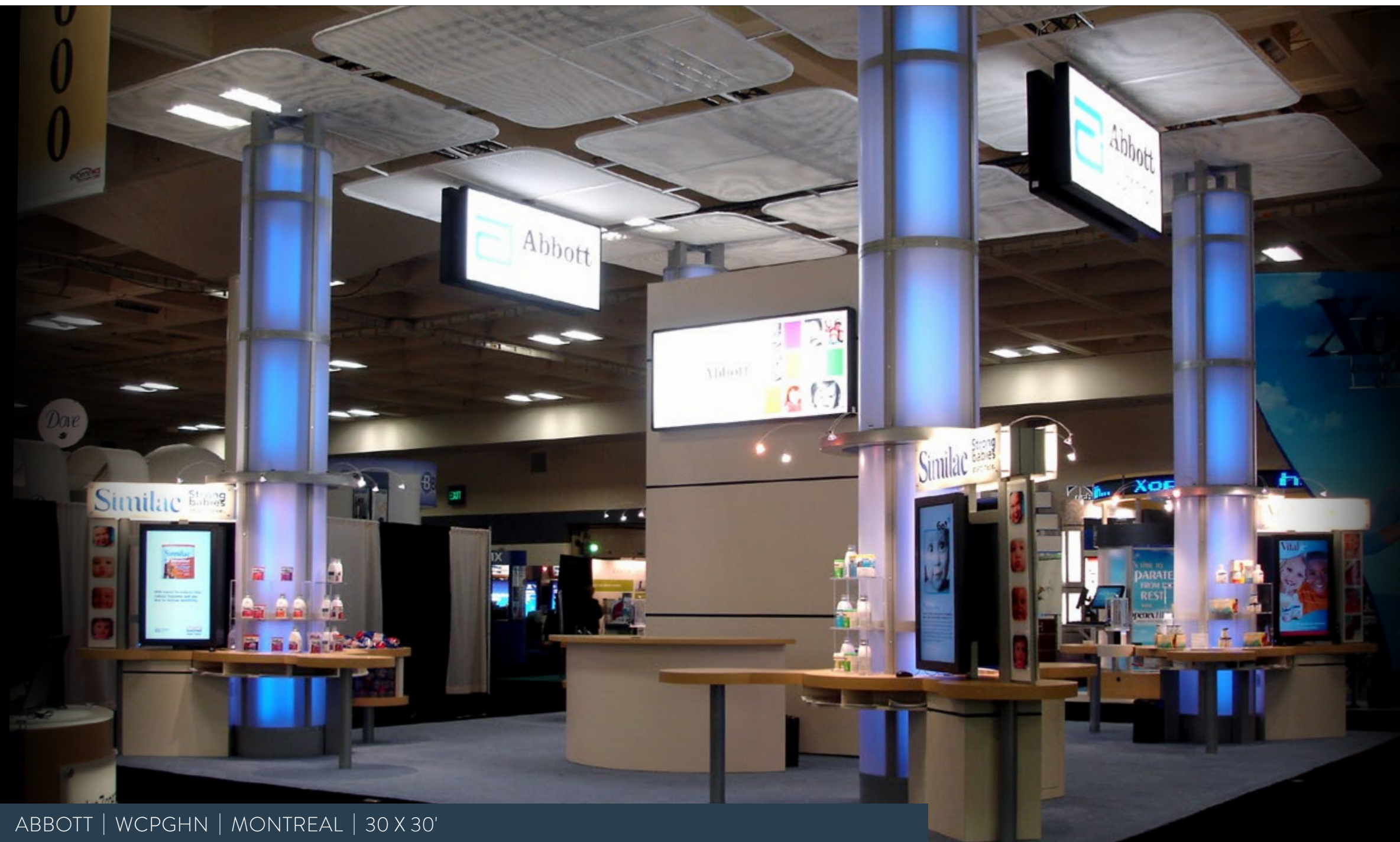
international ABBOTT | WCPGHN | MONTREAL | 30 X 30'

EXPERTS IN THE DESIGN, PRODUCTION, AND MANAGEMENT OF BRANDED ENVIRONMENTS