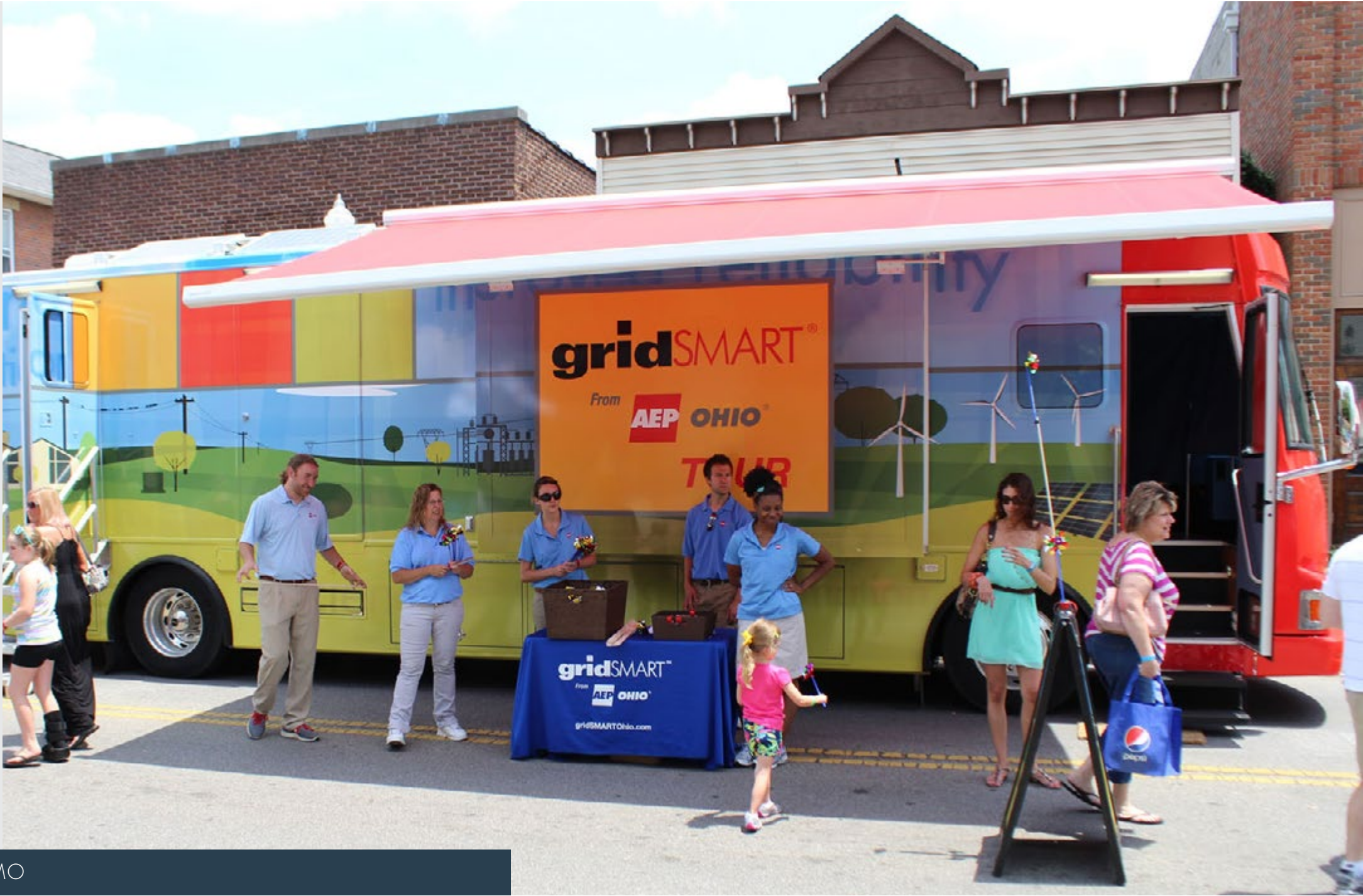
mobile vehicle tours AEP OHIO | GRIDSMART MOBILE DEMO

EXPERTS IN THE DESIGN, PRODUCTION, AND MANAGEMENT OF BRANDED ENVIRONMENTS EXHIBITS | EVENTS | ENVIRONMENTS | MOBILE VEHICLE TOURS | MUSEUM | EXPERIENTIAL