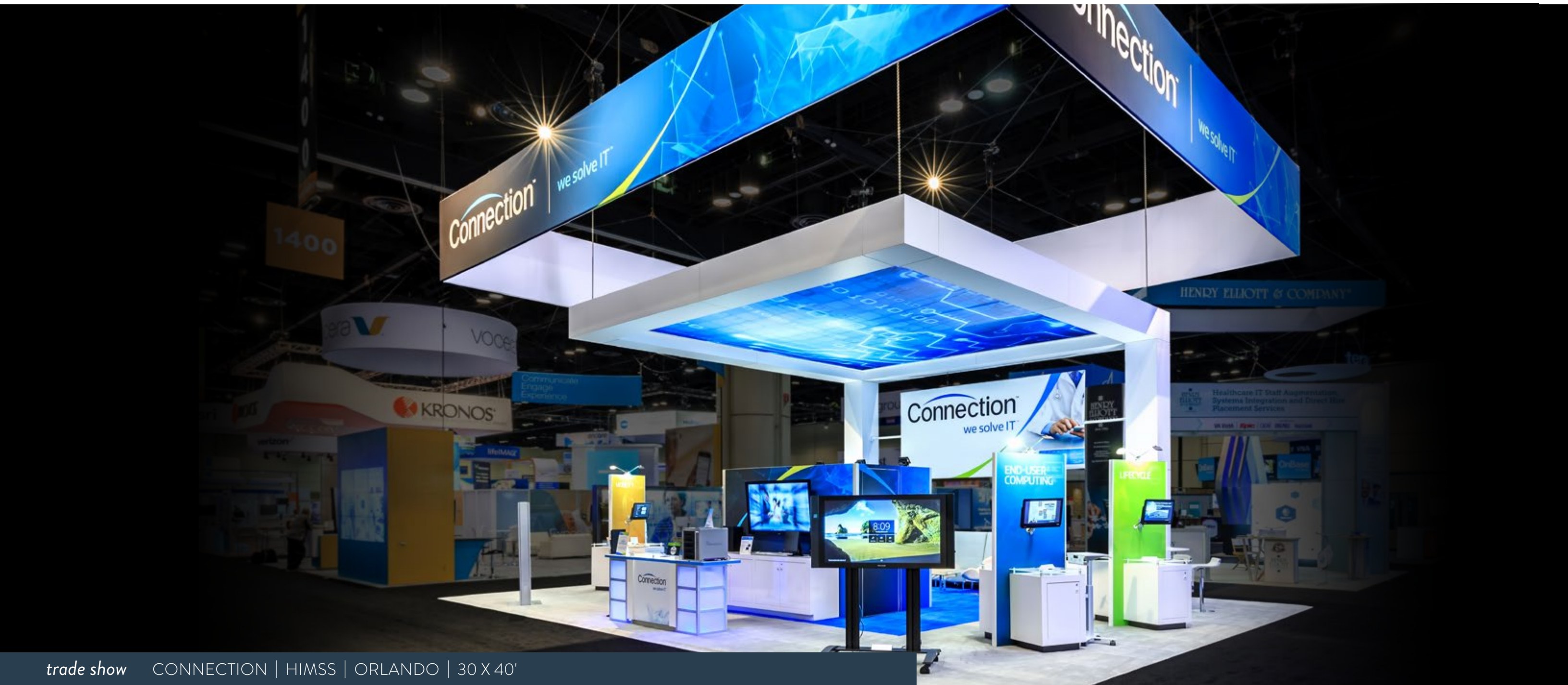
trade show CONNECTION | HIMSS | ORLANDO | 30 X 40'

EXPERTS IN THE DESIGN, PRODUCTION, AND MANAGEMENT OF BRANDED ENVIRONMENTS