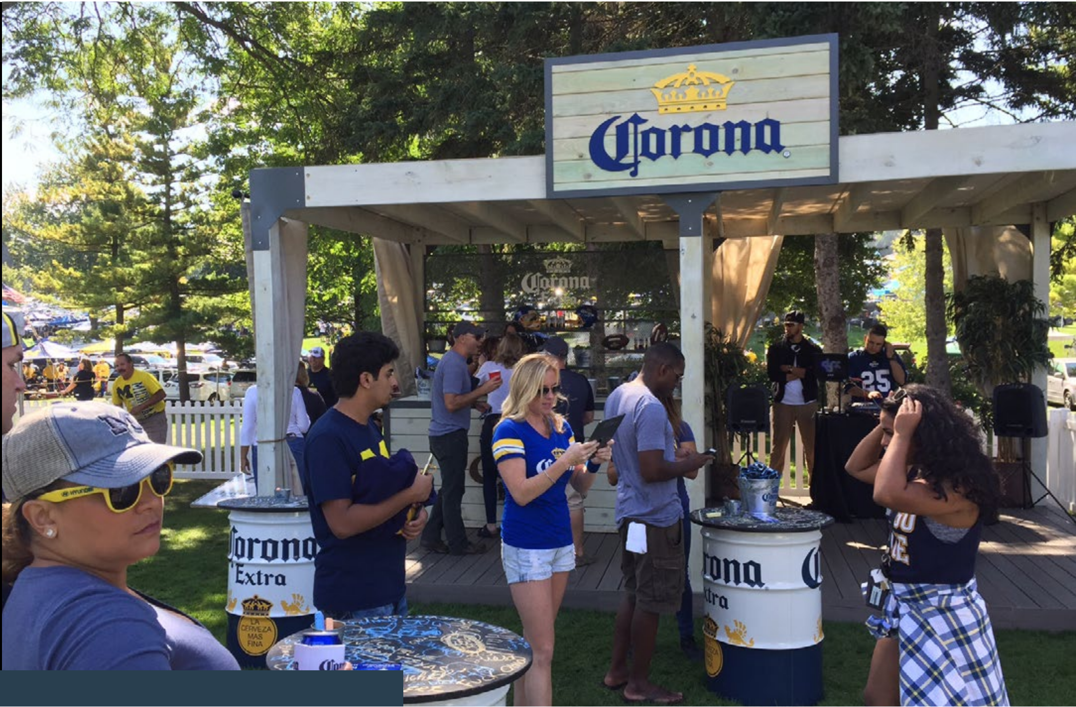
events ENGINE SHOP | CORONA TOUR | MICHIGAN

EXPERTS IN THE DESIGN, PRODUCTION, AND MANAGEMENT OF BRANDED ENVIRONMENTS EXHIBITS | EVENTS | ENVIRONMENTS | MOBILE VEHICLE TOURS | MUSEUM | EXPERIENTIAL