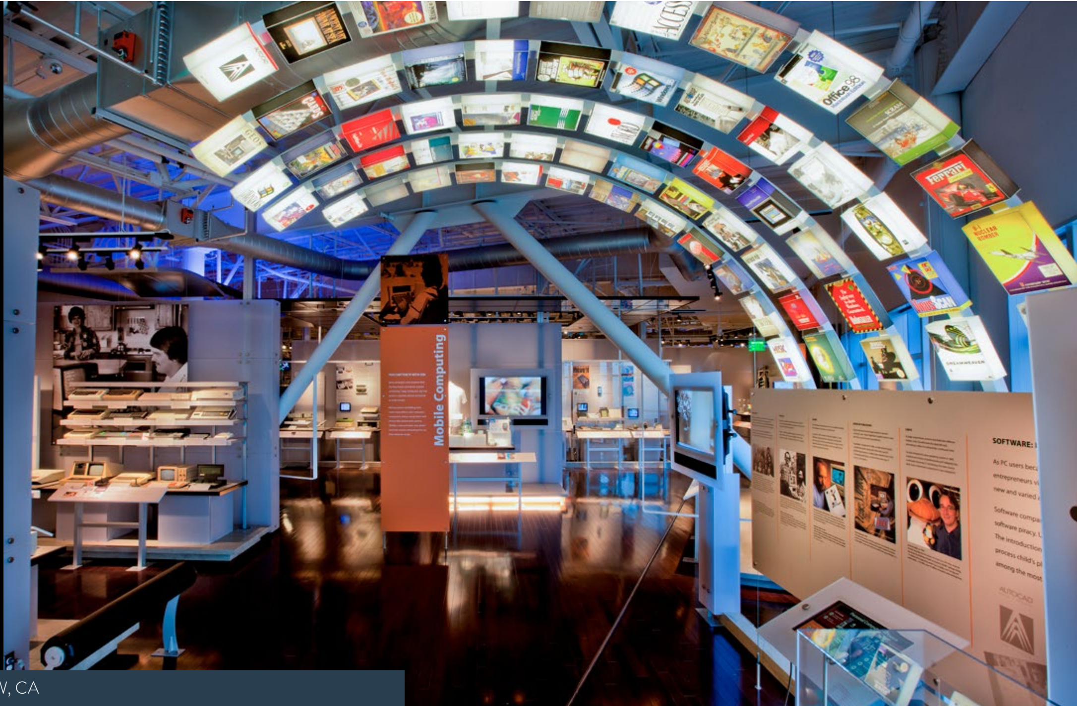
museum COMPUTER HISTORY MUSEUM | MOUNTAIN VIEW, CA

EXPERTS IN THE DESIGN, PRODUCTION, AND MANAGEMENT OF BRANDED ENVIRONMENTS EXHIBITS | EVENTS | ENVIRONMENTS | MOBILE VEHICLE TOURS | MUSEUM | EXPERIENTIAL