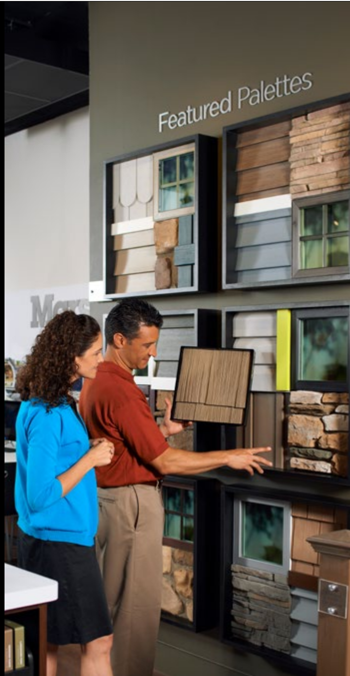
commercial interiors MARSH | PLYGEM SHOWROOM | CINCINNATI