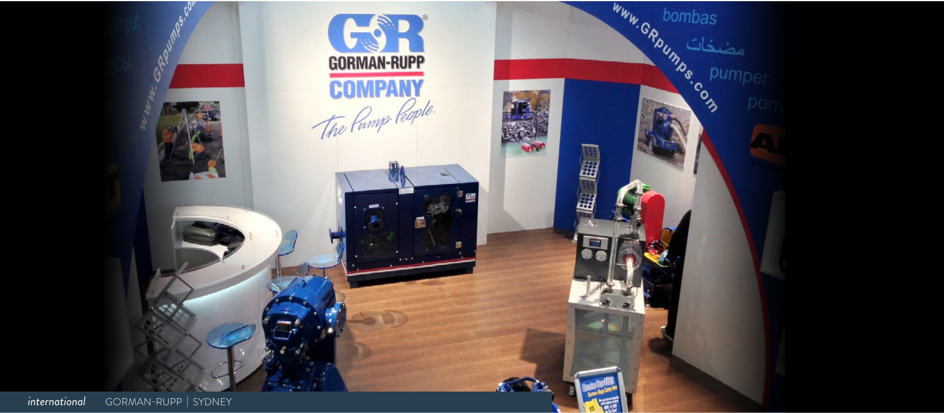
international GORMAN-RUPP | SYDNEY

EXPERTS IN THE DESIGN, PRODUCTION, AND MANAGEMENT OF BRANDED ENVIRONMENTS EXHIBITS | EVENTS | ENVIRONMENTS | MOBILE VEHICLE TOURS | MUSEUM | EXPERIENTIAL