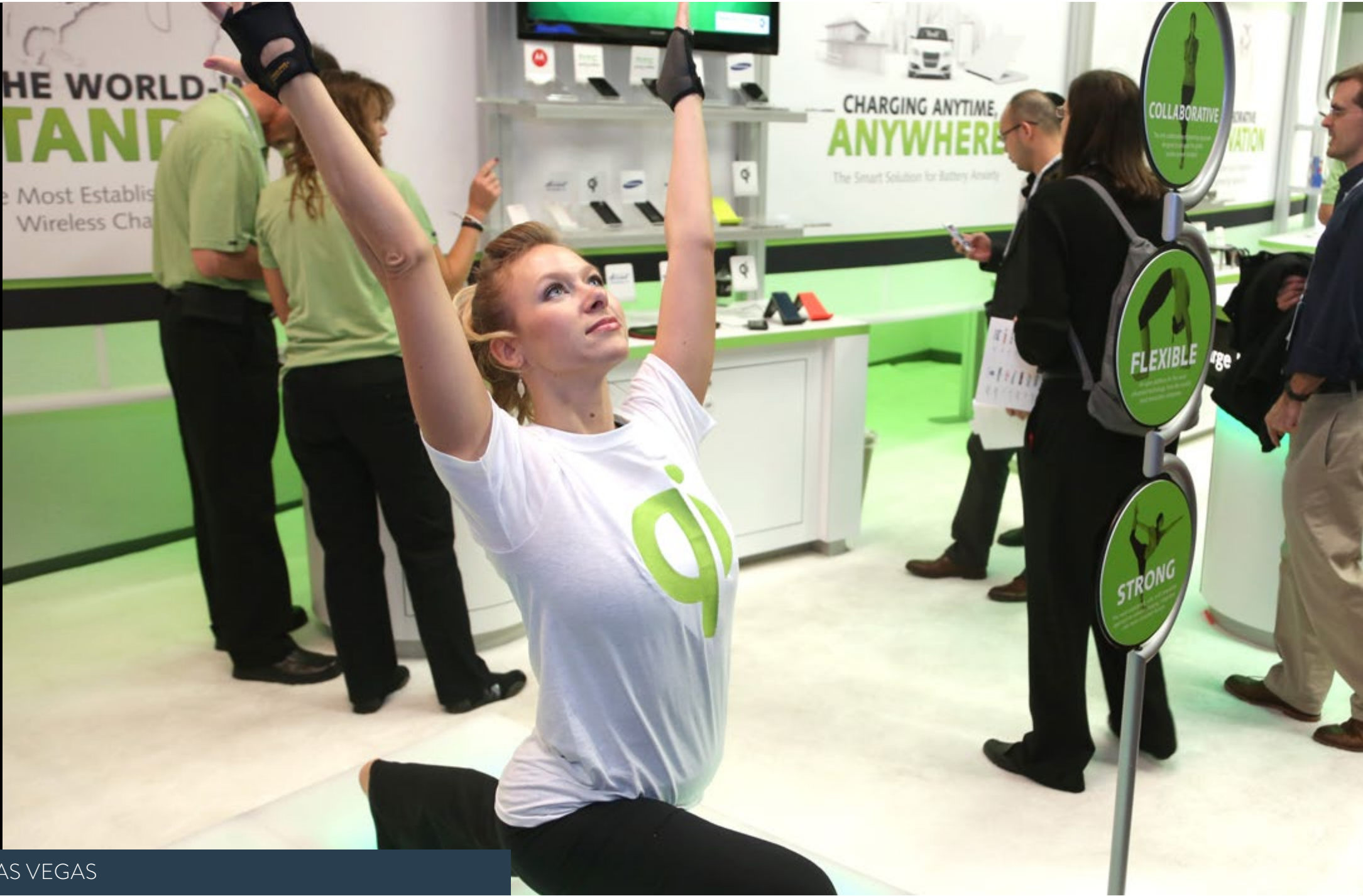
events WIRELESS POWER CONSORTIUM | CES EVENT | LAS VEGAS

EXPERTS IN THE DESIGN, PRODUCTION, AND MANAGEMENT OF BRANDED ENVIRONMENTS EXHIBITS | EVENTS | ENVIRONMENTS | MOBILE VEHICLE TOURS | MUSEUM | EXPERIENTIAL