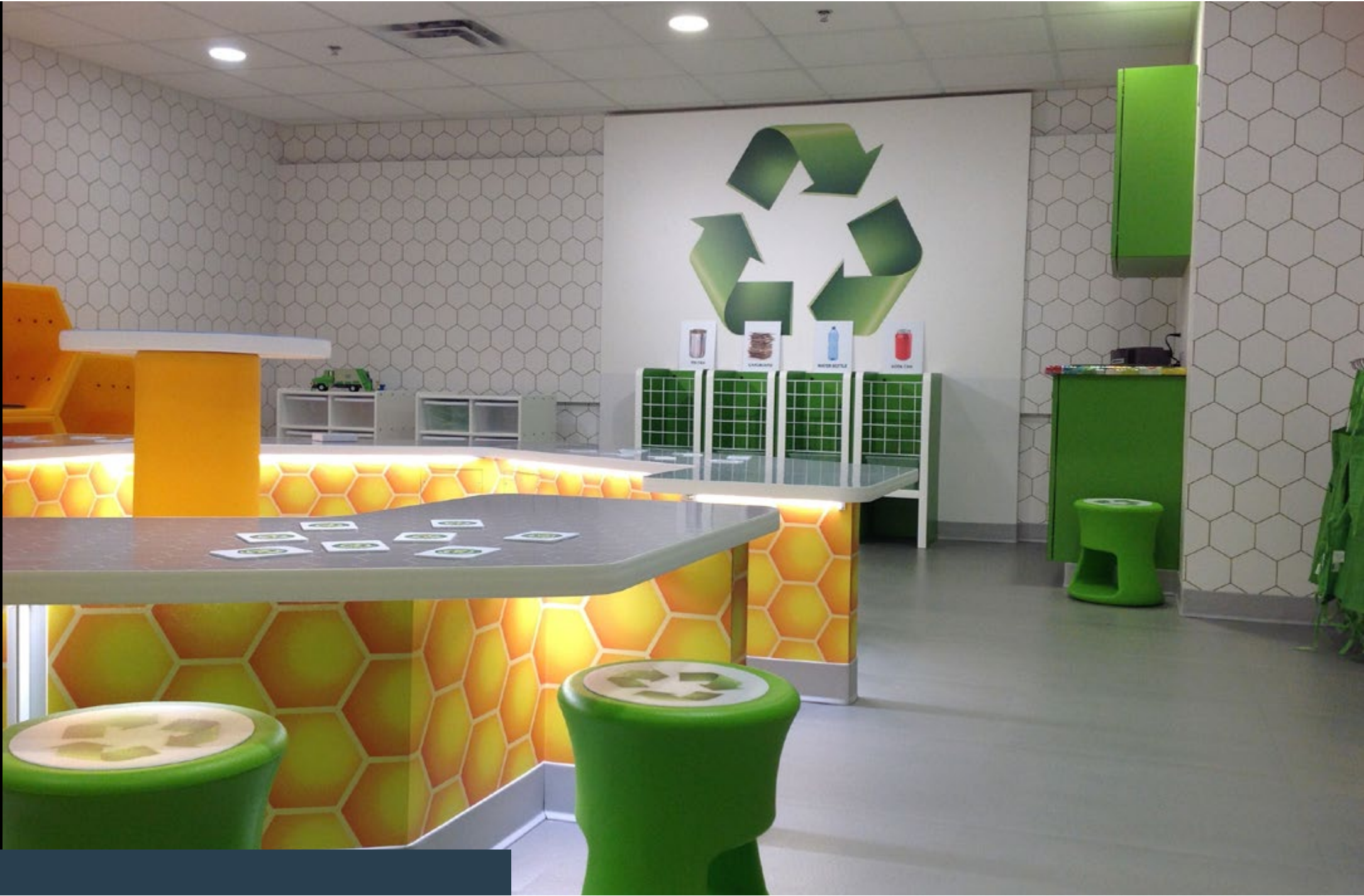
museum ECOLAND | KILGORE, TX