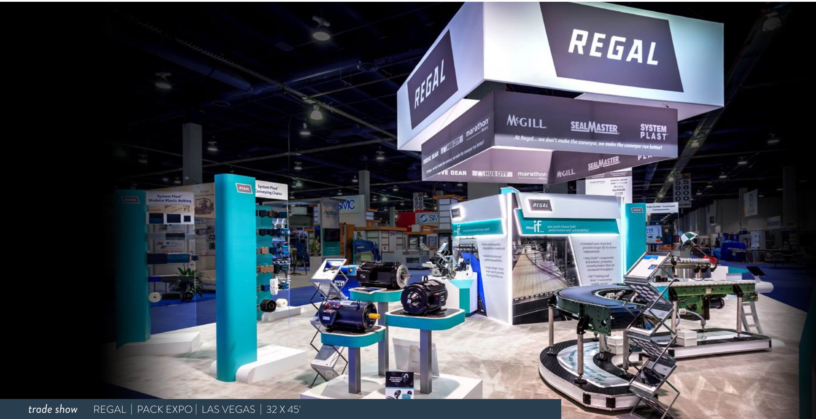
trade show REGAL | PACK EXPO | LAS VEGAS | 32 X 45'

EXPERTS IN THE DESIGN, PRODUCTION, AND MANAGEMENT OF BRANDED ENVIRONMENTS EXHIBITS | EVENTS | ENVIRONMENTS | MOBILE VEHICLE TOURS | MUSEUM | EXPERIENTIAL