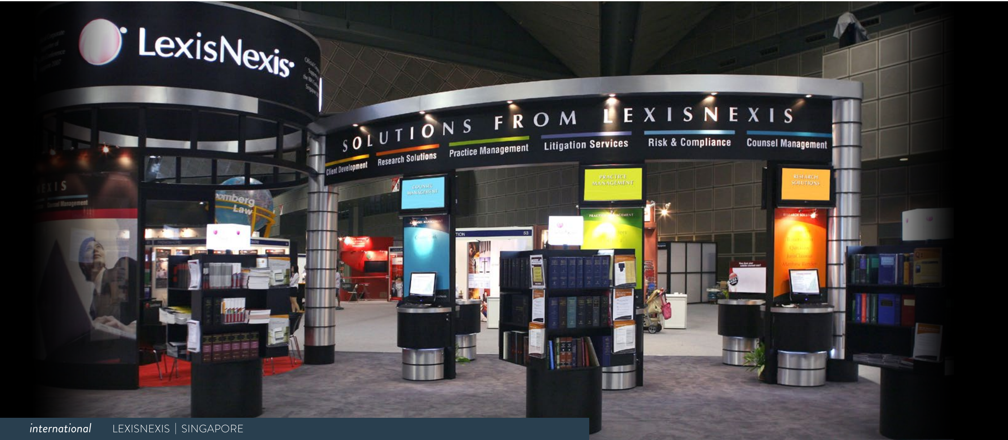
international LEXISNEXIS | SINGAPORE

EXPERTS IN THE DESIGN, PRODUCTION, AND MANAGEMENT OF BRANDED ENVIRONMENTS EXHIBITS | EVENTS | ENVIRONMENTS | MOBILE VEHICLE TOURS | MUSEUM | EXPERIENTIAL