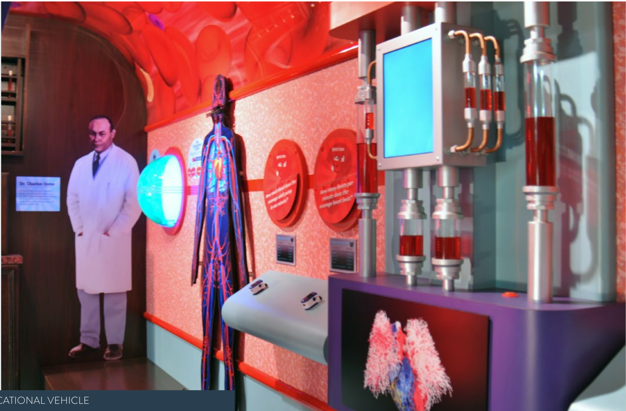
mobile vehicle tours COMMUNITY BLOOD CENTER | EDUCATIONAL VEHICLE

EXPERTS IN THE DESIGN, PRODUCTION, AND MANAGEMENT OF BRANDED ENVIRONMENTS EXHIBITS | EVENTS | ENVIRONMENTS | MOBILE VEHICLE TOURS | MUSEUM | EXPERIENTIAL