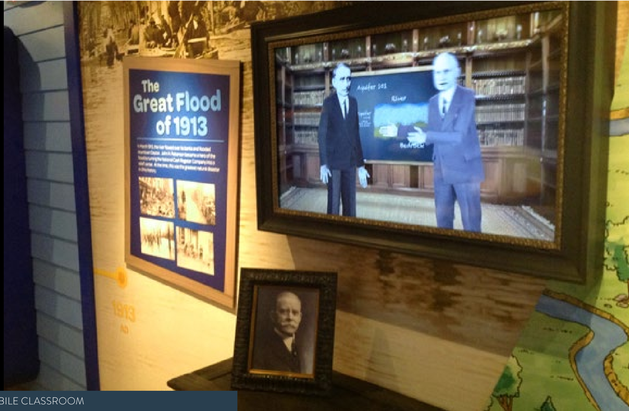
mobile vehicle tours UNIVERSITY OF DAYTON | RIVERMOBILE CLASSROOM

EXPERTS IN THE DESIGN, PRODUCTION, AND MANAGEMENT OF BRANDED ENVIRONMENTS EXHIBITS | EVENTS | ENVIRONMENTS | MOBILE VEHICLE TOURS | MUSEUM | EXPERIENTIAL