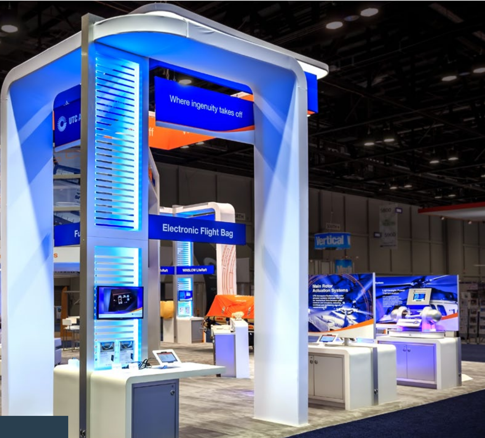
trade show UTC AEROSPACE SYSTEMS | HELI-EXPO | ORLANDO | 40 X 40'

EXPERTS IN THE DESIGN, PRODUCTION, AND MANAGEMENT OF BRANDED ENVIRONMENTS EXHIBITS | EVENTS | ENVIRONMENTS | MOBILE VEHICLE TOURS | MUSEUM | EXPERIENTIAL