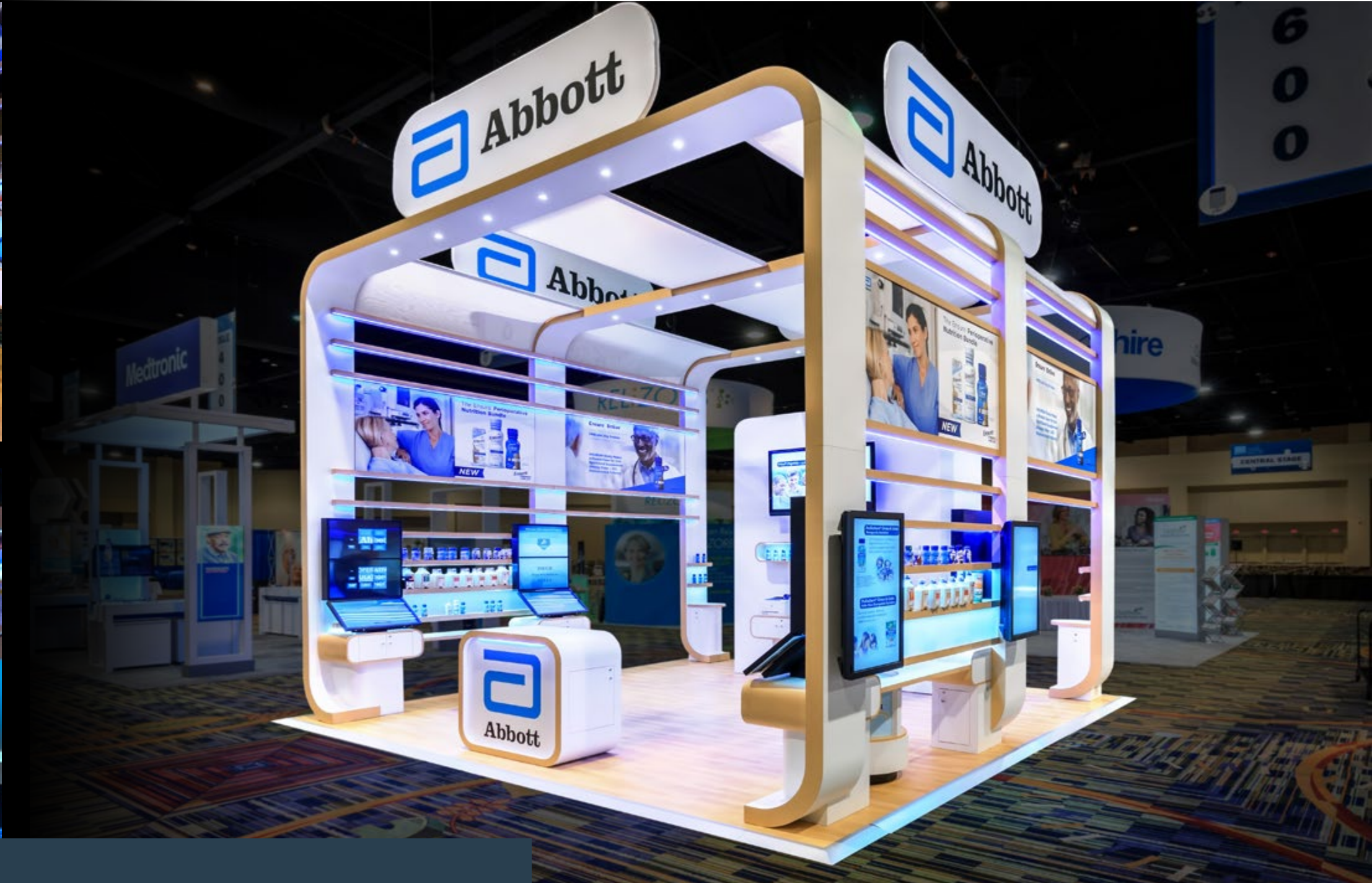
trade show ABBOTT | CNW | ORLANDO | 20 X 20'

EXPERTS IN THE DESIGN, PRODUCTION, AND MANAGEMENT OF BRANDED ENVIRONMENTS EXHIBITS | EVENTS | ENVIRONMENTS | MOBILE VEHICLE TOURS | MUSEUM | EXPERIENTIAL