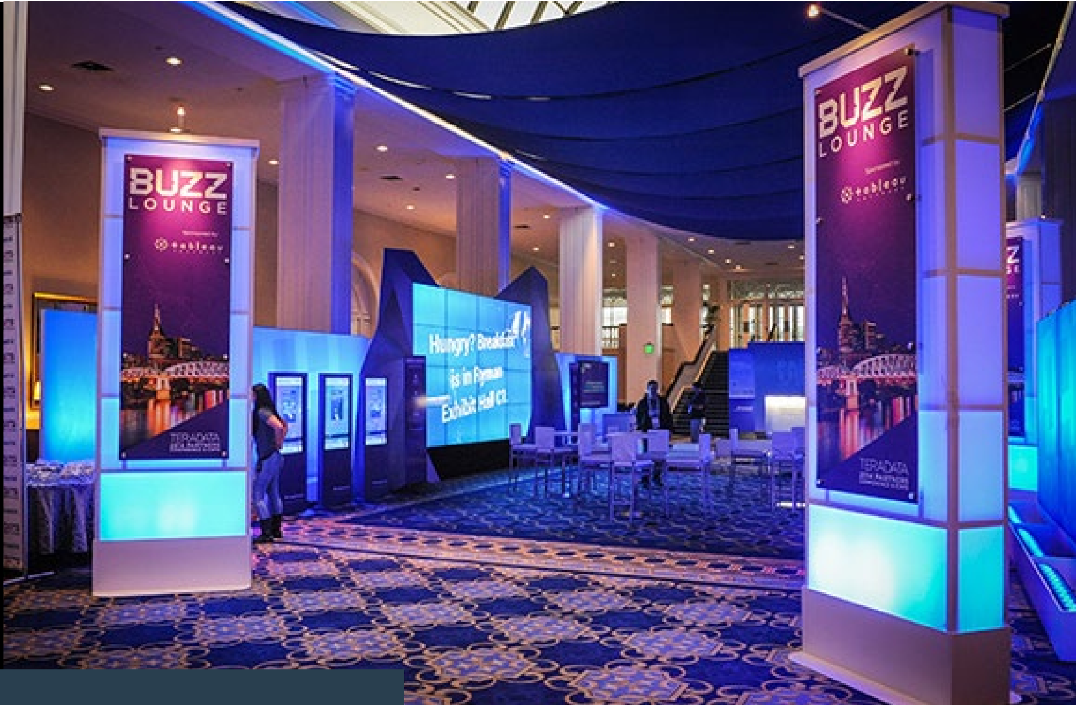
events TERADATA | PARTNERS EVENT | NASHVILLE

EXPERTS IN THE DESIGN, PRODUCTION, AND MANAGEMENT OF BRANDED ENVIRONMENTS EXHIBITS | EVENTS | ENVIRONMENTS | MOBILE VEHICLE TOURS | MUSEUM | EXPERIENTIAL