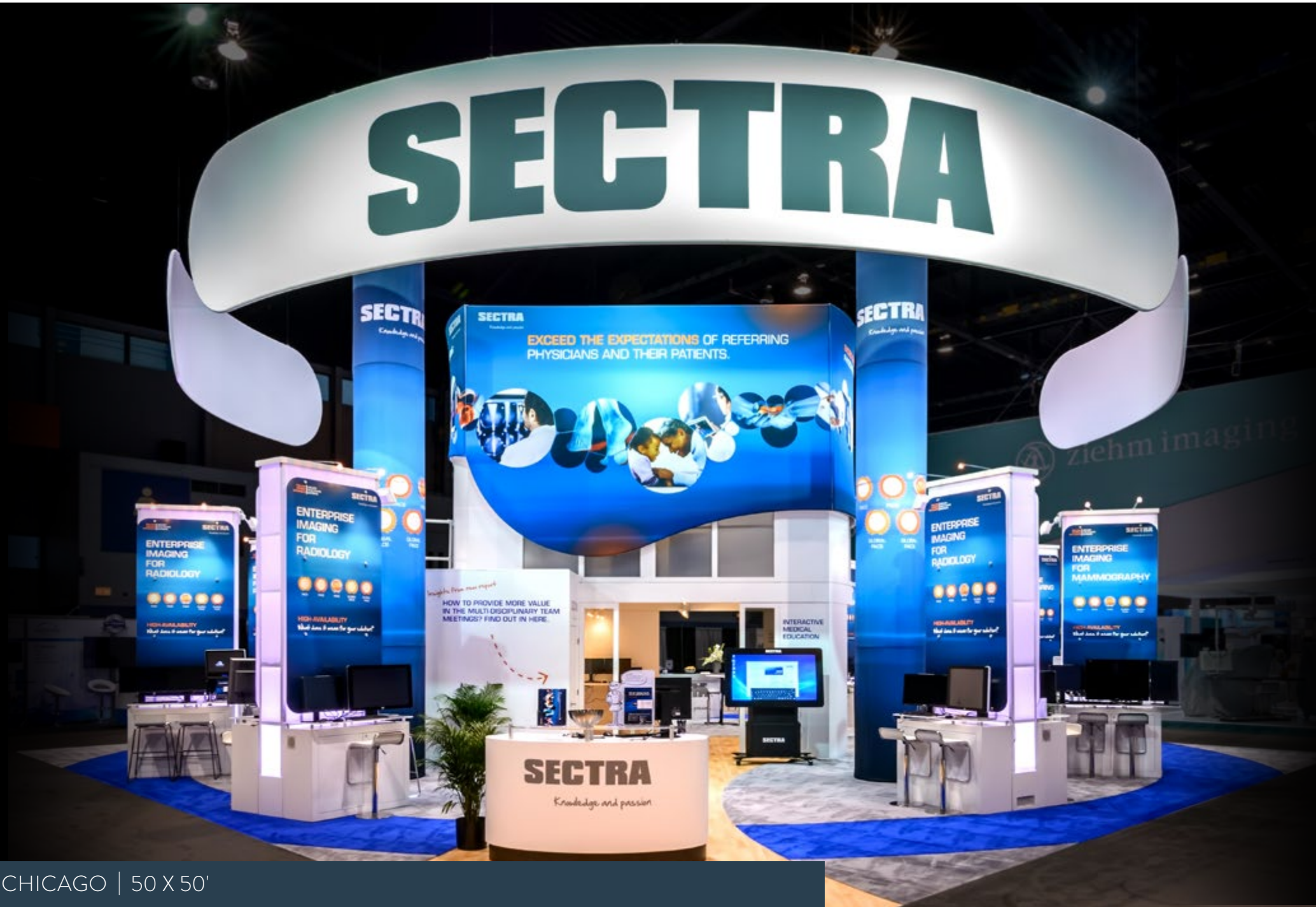
trade show SECTRA | RSNA | CHICAGO | 50 X 50'

EXPERTS IN THE DESIGN, PRODUCTION, AND MANAGEMENT OF BRANDED ENVIRONMENTS EXHIBITS | EVENTS | ENVIRONMENTS | MOBILE VEHICLE TOURS | MUSEUM | EXPERIENTIAL