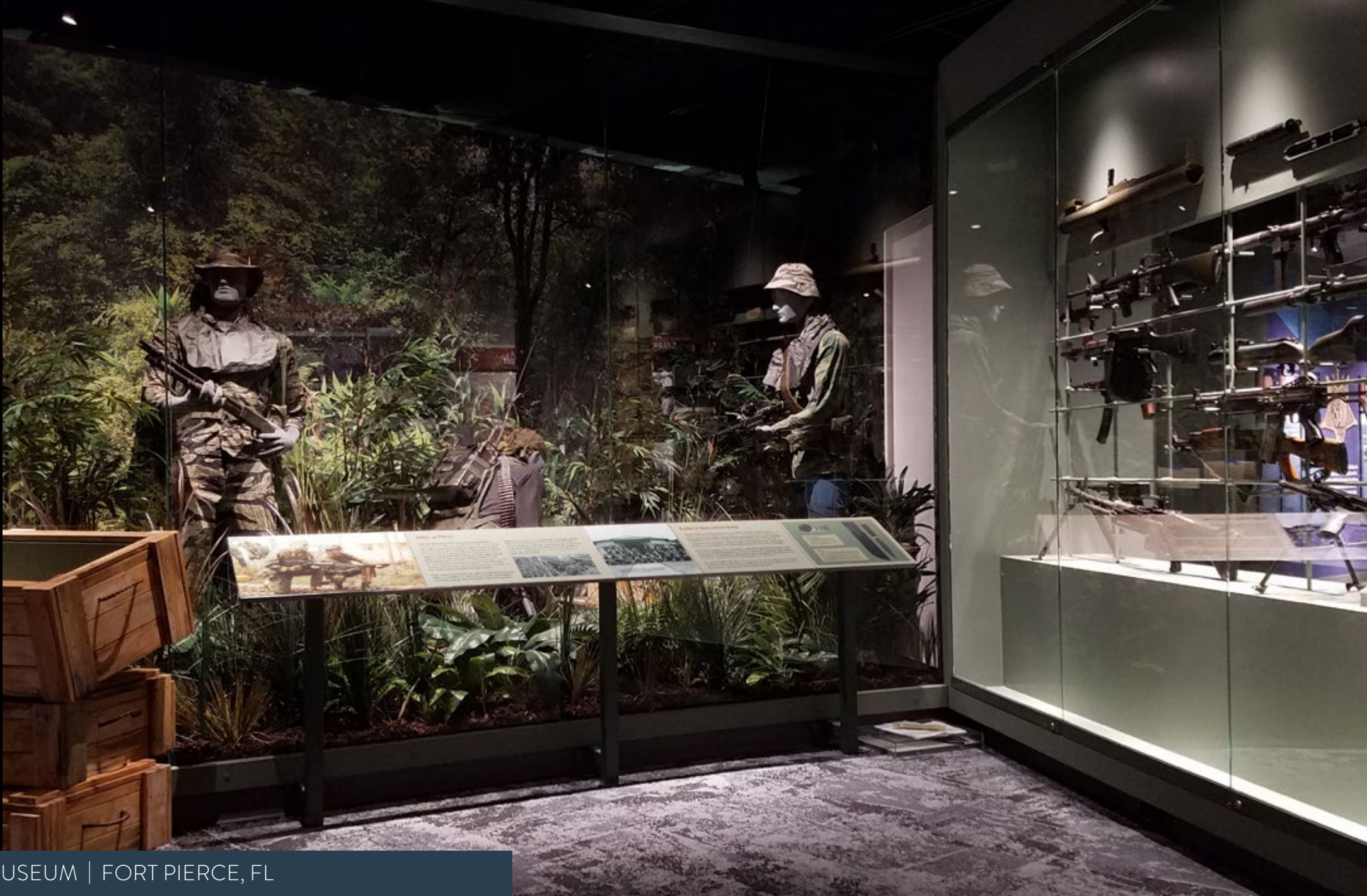
museum VAN SICKLE & ROLLERI | NATIONAL NAVY SEAL MUSEUM | FORT PIERCE, FL

EXPERTS IN THE DESIGN, PRODUCTION, AND MANAGEMENT OF BRANDED ENVIRONMENTS EXHIBITS | EVENTS | ENVIRONMENTS | MOBILE VEHICLE TOURS | MUSEUM | EXPERIENTIAL