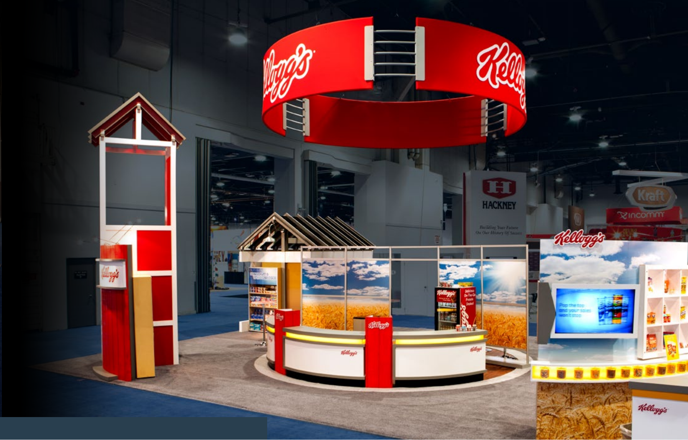
trade show KELLOGG'S | NAMA | LAS VEGAS | 20 X 20'

EXPERTS IN THE DESIGN, PRODUCTION, AND MANAGEMENT OF BRANDED ENVIRONMENTS EXHIBITS | EVENTS | ENVIRONMENTS | MOBILE VEHICLE TOURS | MUSEUM | EXPERIENTIAL