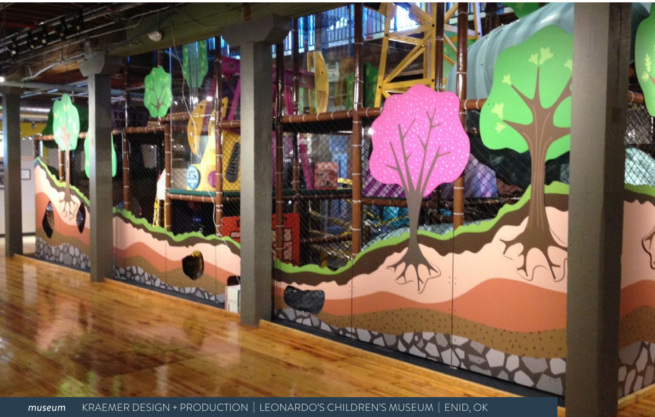
museum KRAEMER DESIGN + PRODUCTION | LEONARDO'S CHILDREN'S MUSEUM | ENID, OK