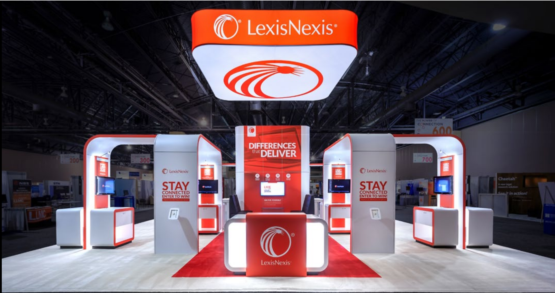
trade show LEXISNEXIS 40 X 40'

EXPERTS IN THE DESIGN, PRODUCTION, AND MANAGEMENT OF BRANDED ENVIRONMENTS EXHIBITS | EVENTS | ENVIRONMENTS | MOBILE VEHICLE TOURS | MUSEUM | EXPERIENTIAL