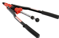
Nut Rivet Insertion Tool (HN-02)