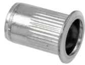
M6 LHT Nut Rivet (SBRNL-064.0)