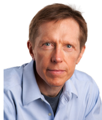
Neil Howe Author, Historian and Economist