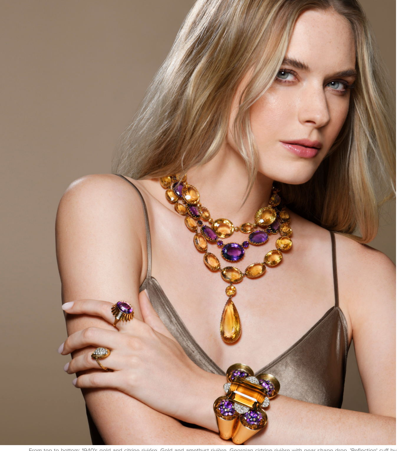
From top to bottom: 1940's gold and citrine riviére. Gold and amethyst rivière. Georgian cirtrine rivière with pear shape drop. 'Reflection' cuff by Trabert & Hoeffer Mauboussin c., 1940's in citrine, amethyst and diamond. Retro amethyst and diamond ring. 1970's gold and diamond snake ring.