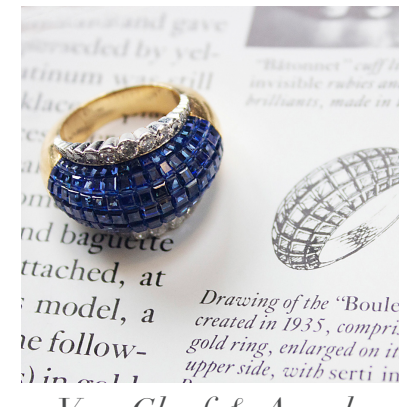
Van Cleef & Arpels