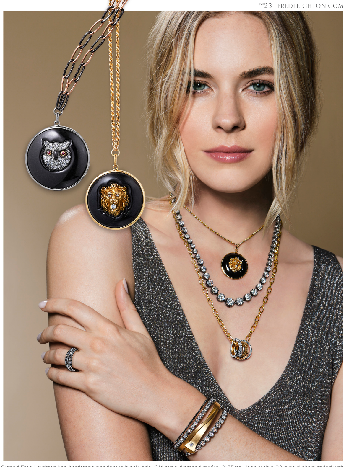
From top: Signed Fred Leighton lion hardstone pendant in black jade. Old mine diamond riviére, 31.75cts. Jean Mahie 22kt gold chain styled with three antique wedding bands. Thin black diamond bangle. Signed Fred Leighton narrow pave bangle with rose cut diamonds. Antique gold and diamond nail bracelet. Signed Fred Leighton graduated rose cut diamond bangle. Signed Fred Leighton rose cut diamond bombe ring.

Introducing our new hardstone pendants. Featuring antique and vintage elements, each necklace is one of a kind. Worn singly or layered, these necklace create a fresh and unique look.