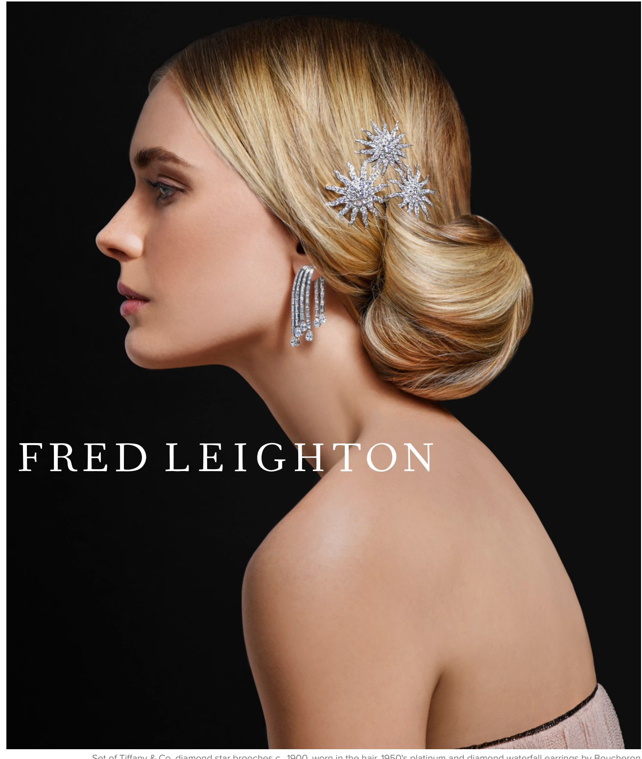
Set of Tiffany & Co. diamond star brooches c., 1900, worn in the hair. 1950's platinum and diamond waterfall earrings by Boucheron.