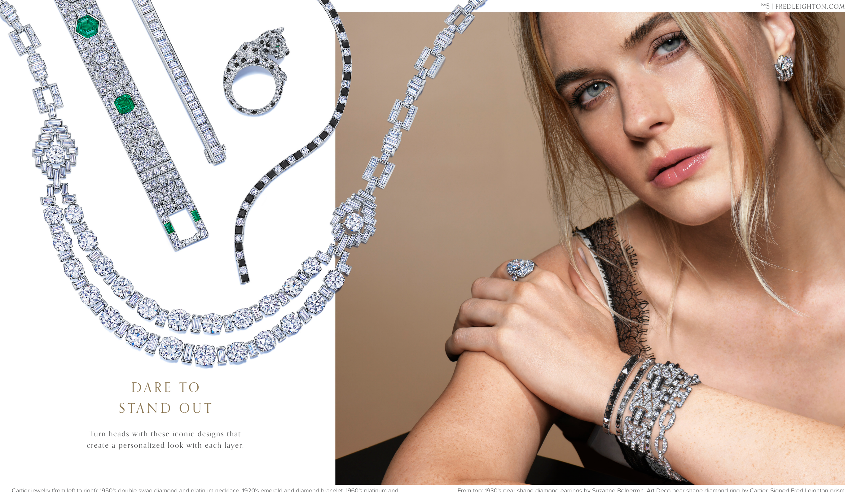
Cartier jewelry (from left to right): 1950's double swag diamond and platinum necklace. 1920's emerald and diamond bracelet. 1960's platinum and baguette diamond line bracelet. Diamond and onyx panther ring. 1920's platinum, onyx and diamond alternating line bracelet.