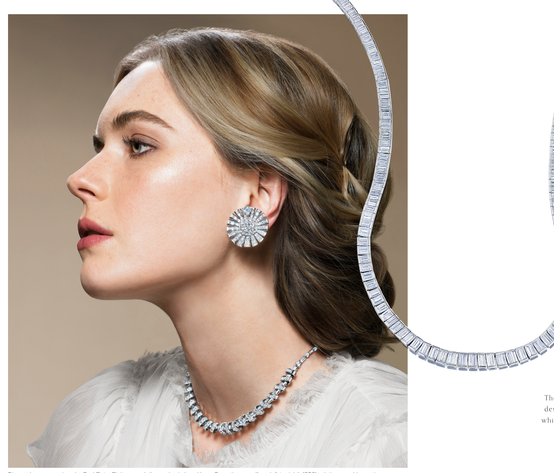
Diamond sunray earrings by Paul Flato. Platinum and diamond spiral necklace. Opposite page (from left to right): 1950's platinum and baguette diamond line necklace. 1950's diamond necklace by Van Cleef & Arpels.