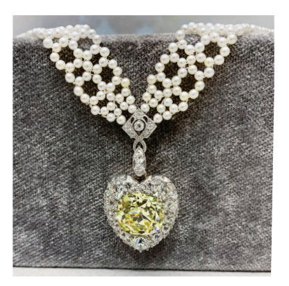
Tiffany & Co