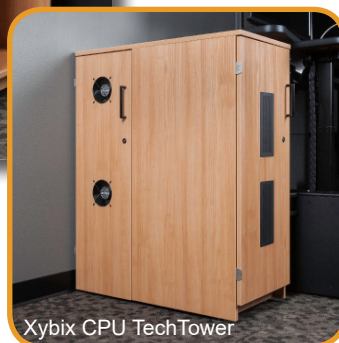
Xybix CPU TechTower