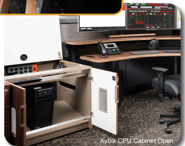
Xybix CPU Cabinet Open