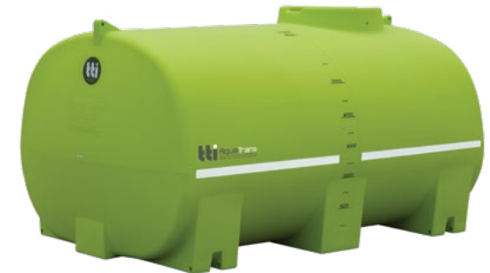
AquaTrans™ 6000L with 20-Year Warranty Dim: 2760 x 2000 x 1540 (mm) Code: PTC06000SG $ 6,980*