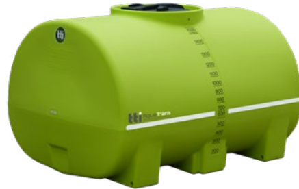
AquaTrans™ 1500L with 20-Year Warranty Dim: 1720 x 1230 x 1000 (mm) Code: PTC01500SG $ 2,165*