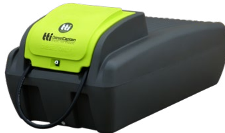
600L DieselCaptain™ 45L/min 12v Piusi Pump Dim: 1700 x 880 x 740 (mm) Code: DUL0600LF045V1 $ 1,853*