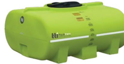
AquaTrans™ 800L with 20-Year Warranty Dim: 1430 x 1220 x 670 (mm) Code: PTC00800SG $ 1,490*