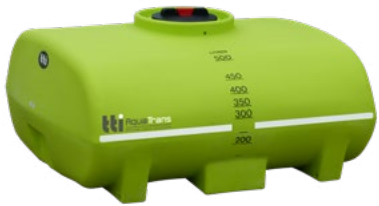
AquaTrans™ 500L with 20-Year Warranty Dim: 1250 x 1070 x 580 (mm) Code: PTC00500SG $ 1,103*

ø455 Lid Seal; ø455 Lid, Rim, & Seal Assy; Stainless Steel Screws; 1, 2 & 3" MBSP outlet options