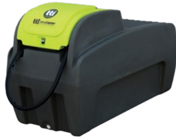
300L DieselCaptain™ 45L/min 12v Piusi Pump Dim: 1270 x 600 x 790 (mm) Code: DUL0300ALF045V1 $ 1,550*