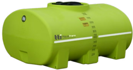
AquaTrans™ 1200L with 20-Year Warranty Dim: 1720 x 1230 x 840 (mm) Code: PTC01200SG $ 1,760*