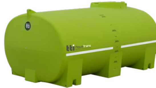
AquaTrans™ 5000L with 20-Year Warranty Dim: 2760 x 2000 x 1400 (mm) Code: PTC05000SG $ 5,953*