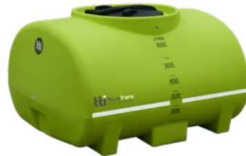
AquaTrans™ 600L with 20-Year Warranty Dim: 1250 x 1070 x 740 (mm) Code: PTC00600SG $ 1,211*