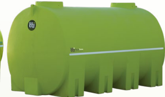
AquaTrans™ 17000L with 20-Year Warranty Dim: 4310 x 2350 x 2395 (mm) Code: PTC17000SG $ 18,206*