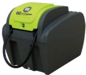
200L DieselCaptain™ 40L/min 12v DieselFlo Pump Dim: 1150 x 820 x 565 (mm) Code: DUL0200ALD040V1 $ 998*