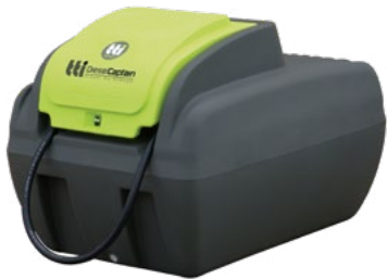
400L DieselCaptain™ 45L/min 12v Piusi Pump Dim: 1150 x 820 x 780 (mm) Code: DUL0400LF045V1 $ 1,699*