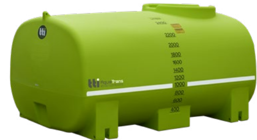
AquaTrans™ 2400L with 20-Year Warranty Dim: 2150 x 1410 x 1140 (mm) Code: PTC02400SG $ 3,241*