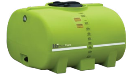
AquaTrans™ 1000L with 20-Year Warranty Dim: 1430 x 1220 x 835 (mm) Code: PTC01000SG $ 1,640*