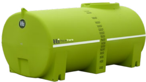
AquaTrans™ 3000L with 20-Year Warranty Dim: 2430 x 1540 x 1200 (mm) Code: PTC03000SG $ 4,244*