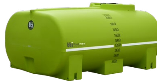
AquaTrans™ 2000L with 20-Year Warranty Dim: 1250 x 1410 x 870 (mm) Code: PTC02000SG $ 2,849*