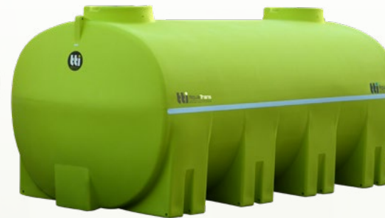
AquaTrans™ 15000L with 20-Year Warranty Dim: 4310 x 2350 x 2040 (mm) Code: PTC15000SG $ 16,086*