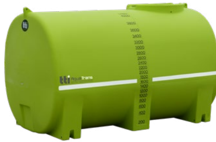
AquaTrans™ 4000L with 20-Year Warranty Dim: 2430 x 1540 x 1450 (mm) Code: PTC04000SG $ 4,966*