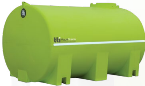
AquaTrans™ 10000L with 20-Year Warranty Dim: 3480 x 2250 x 1940 (mm) Code: PTC10000SG $ 11,587*