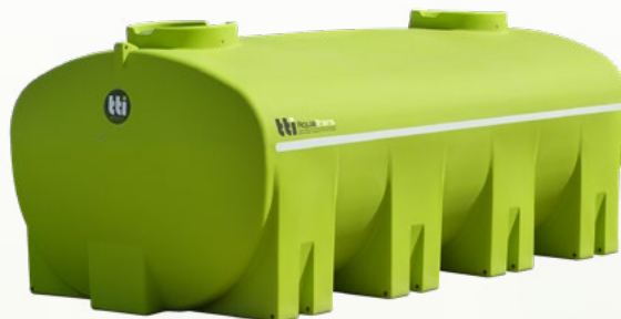
AquaTrans™ 13000L with 20-Year Warranty Dim: 4310 x 2350 x 1795 (mm) Code: PTC13000ASG $ 13,924*