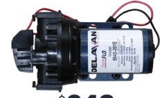
7.5L/min 100psi 12v Pump Code: I-00399