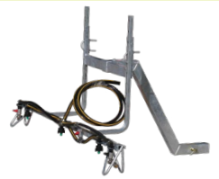
Tow Hitch Mounting Bracket for Boomless Nozzle (Boomless Nozzle Excluded) Code: I-07744