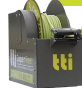
SuperReel™ 50m Auto-Rewind Reel & Free Spray Gun Code: I-09839