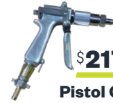
Multi-Purpose Spray Gun Code: I-01110