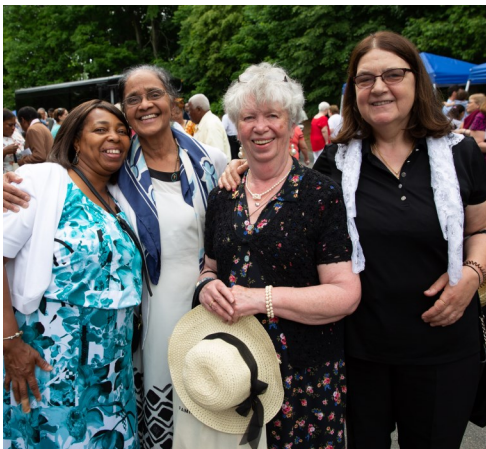
Women gather outside after the celebration to enjoy some refreshments and each other's company.