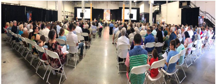
People gather for the celebration for Venerable Patrick Peyton.

"The Family Rosary is, in a spiritual sense, the food, air, and water of a family."