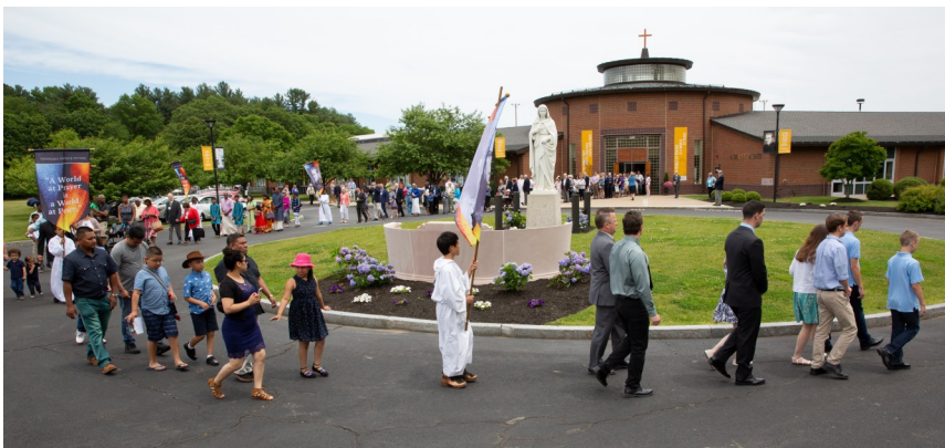
The Eucharistic Procession of nearly 200 people departs from Holy Cross Family Ministries to the Sacred Space.