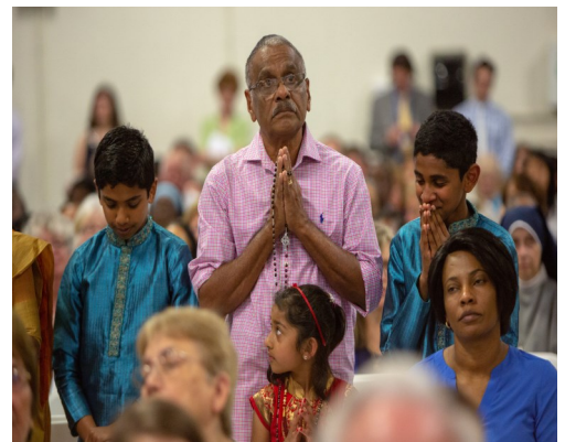
A family leading a decade of the Rosary.