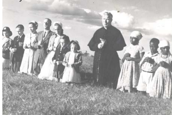
Father Peyton Praying the Rosary with a group in Kenya.

Reminder: The month of July is dedicated to the Precious Blood of Jesus.