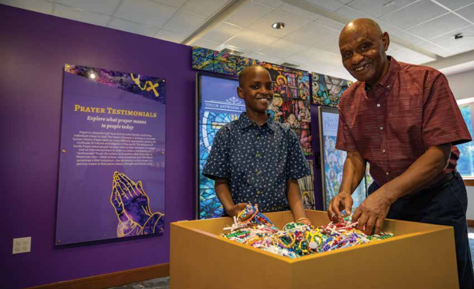
All visitors are given a Rosary to continue family prayer at home after their experience at the museum.