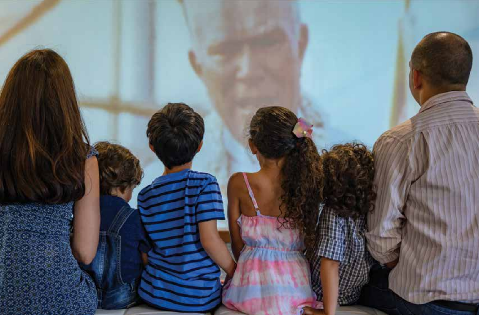
A family watches vintage footage of Venerable Patrick Peyton in the Museum of Family Prayer.