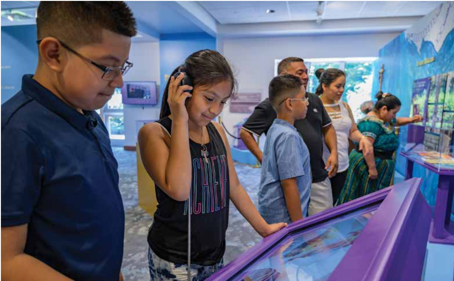
Students and families will have the opportunity to experience prayer in a new and engaging way at the museum.

This first-of-its-kind museum offers a unique, interactive experience of prayer using media for the entire family to experience together. From classic footage of Father Peyton to modern testimonies on the personal impact of prayer, the Museum of Family Prayer offers a space to touch, listen, watch, reflect, and pray.