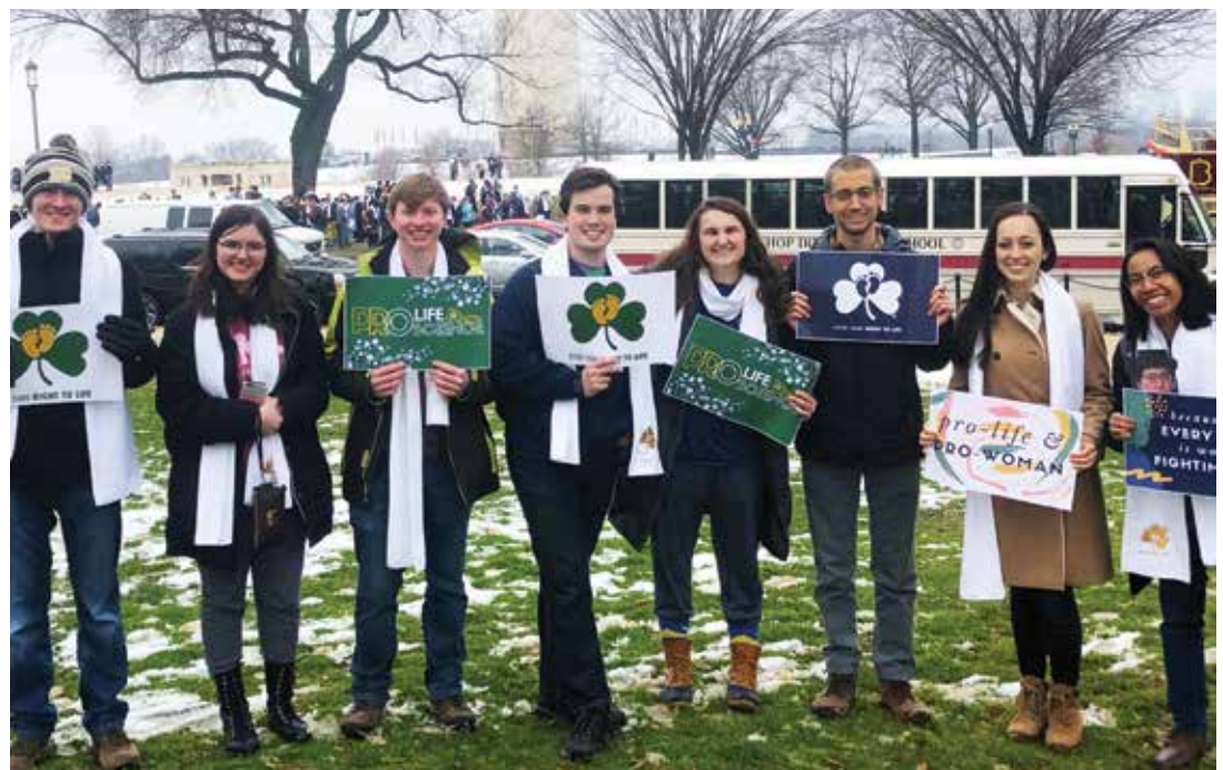
Members of the Student Chapter of the Father Peyton Guild at the March for Life event in Washington, D.C.