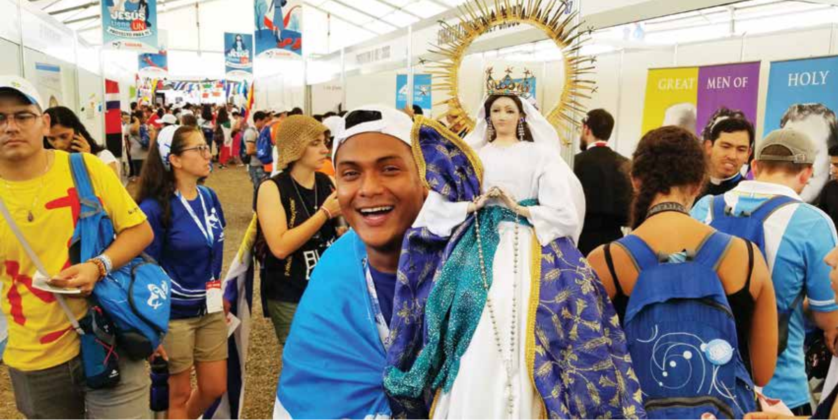
World Youth Day attendee proudly carries Santa María La Antigua, Our Lady of La Antigua, the patron saint of Panama.