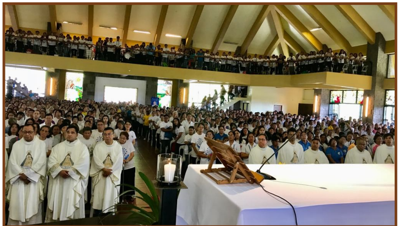
The Bishop and priests from Antipolo and Holy Cross stand side by side with Marian devotees for the culminating Mass of the Rosary Rally.