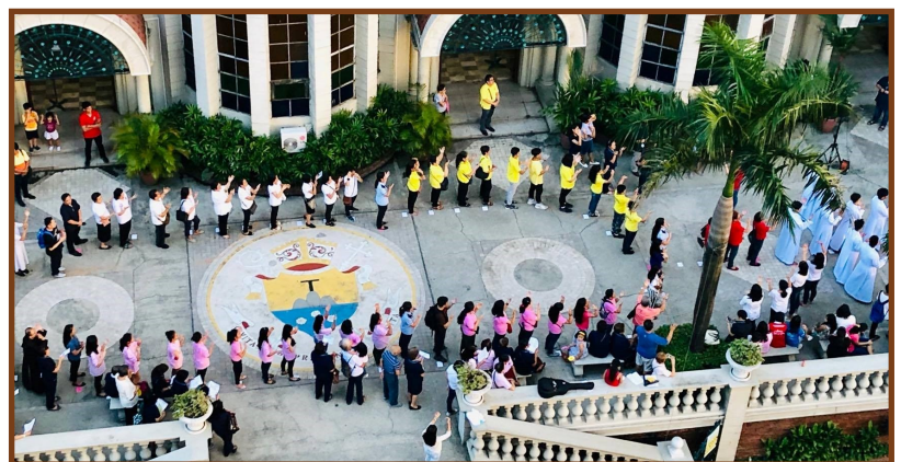
The FRC-ICC Unit, in cooperation with the parish of the Immaculate Conception Cathedral in Cubao, organized a living Rosary in celebration of the Feast of Our Lady of the Holy Rosary on October 8, 2019.