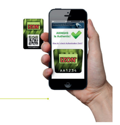
End-users can scan the 2D code via a smart phone app and receive a Traceology<sup>®</sup> eVerification message.