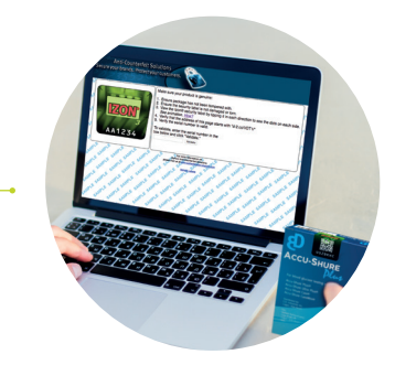
Desktop web entry allows for end-users to enter the serial number to validate the authenticity.