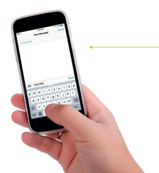
SMS Texting optionfor serial number verification is available.