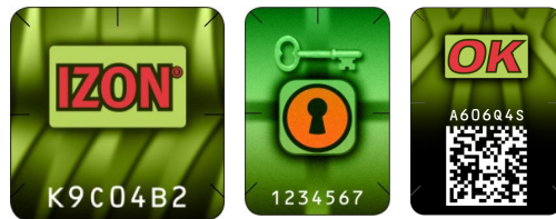
Izon® 3D Labels