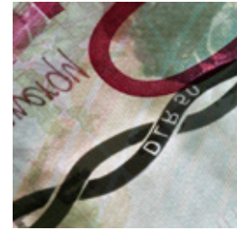
Demetallised micro text