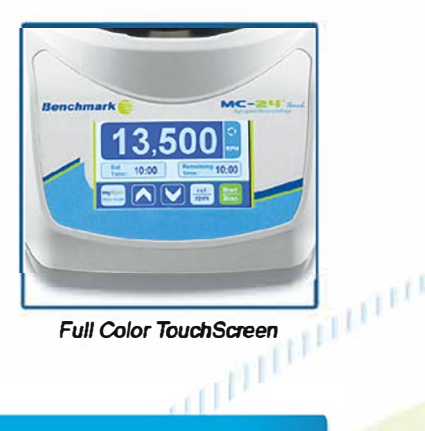
Full Color TouchScreen