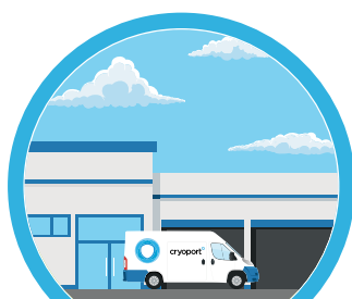
CRYOPORT LOGISTICS CENTER

Through the launch of our Cryoshuttle™ local pickup and delivery service, Cryoport provides even more security and certainty for your valuable commodities. Our Cryoshuttle™ solution extends our market leading Chain of Compliance™ processes even deeper within your supply chain with seamless direct handling, traceability and visibility of your materials during local transport to and from manufacturing sites, hospitals, and clinics from your nearest Cryoport facility thus reducing risk.