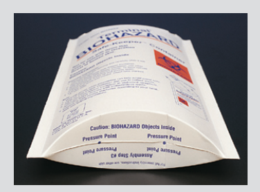
Features: Solid bottom construction avoids leaks; can be wall-mounted.