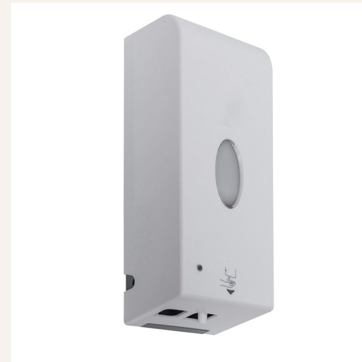
Wall mounted Auto Dispenser with 1 litre of gel.