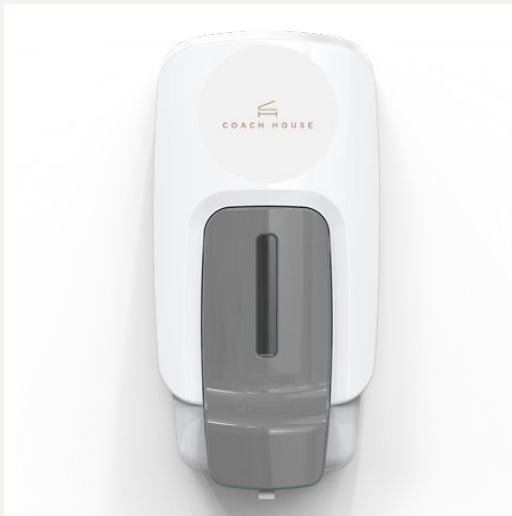
Wall mounted Push Dispenser with 1 litre of gel.