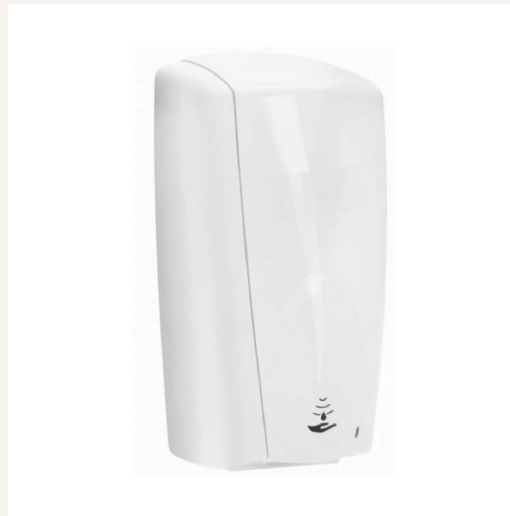
Premium wall mounted Automatic gel dispenser with 1100ml of gel.