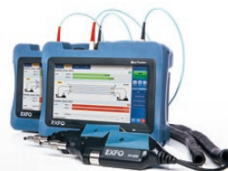
MaxTester 940 Fiber Certifier OLTS