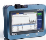
MaxTester 700B OTDR Series