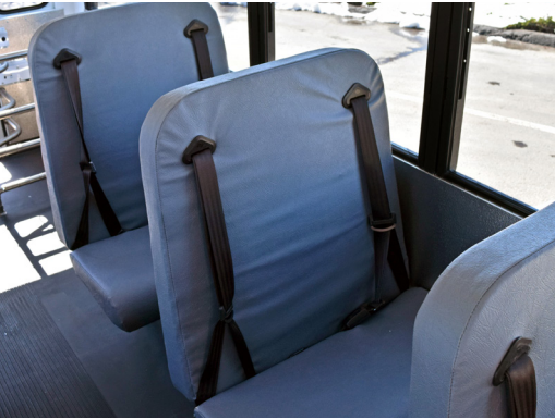
3 Point Seatbelt Options