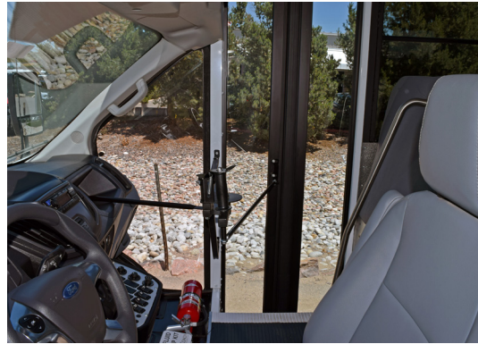
Industry's Largest Passenger-side Cab Window