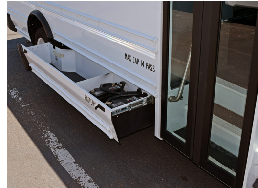
Storage Compartment Holds up to 120 lbs