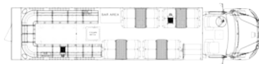
35 Passenger - Limo Style Seating, Tables & Bar