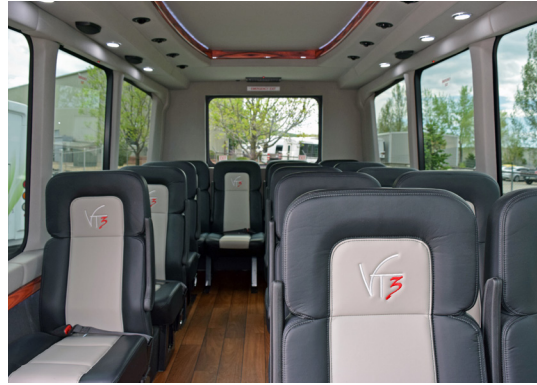
74" Interior Width by 75" Interior Height