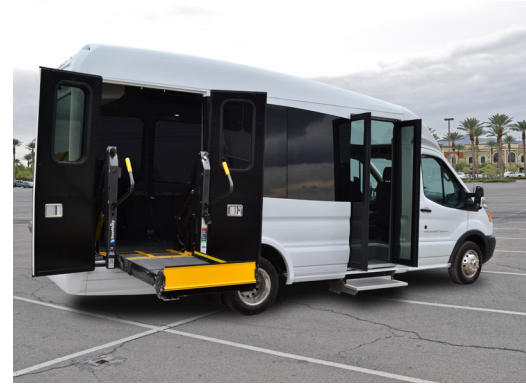
Available Wheelchair Lift