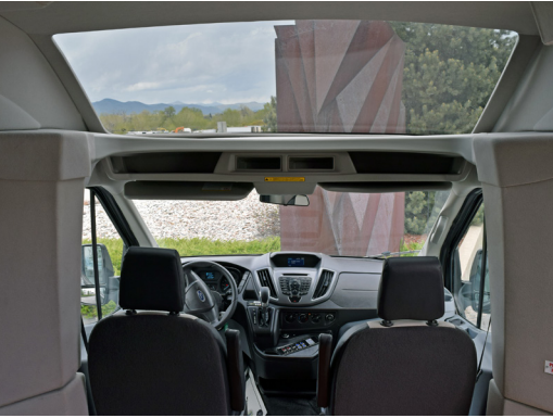
Scenic Passenger Windshield