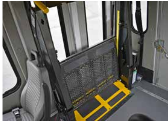
Ricon Klearvue Wheelchair Lift for Unobstructed Passenger View