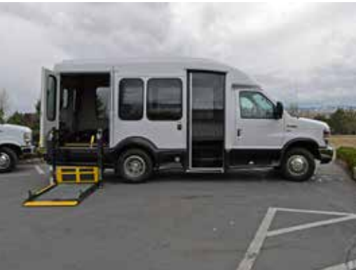
ADA Rear Wheelchair Lift