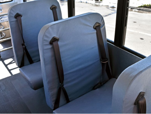
3 Point Seatbelt Options