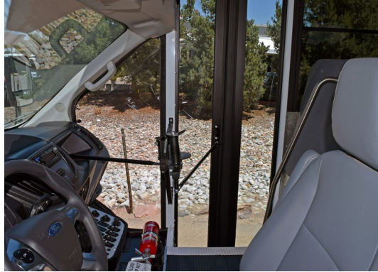
Industry's Largest Passenger-side Cab Window