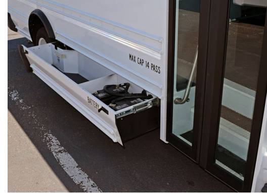
Storage Compartment Holds up to 120 lbs