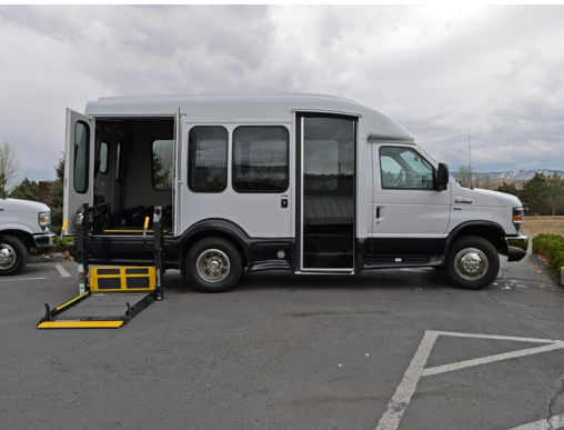
ADA Rear Wheelchair Lift