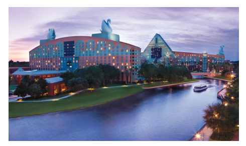
NORTH AMERICA 12 - 14 September Orlando, FL