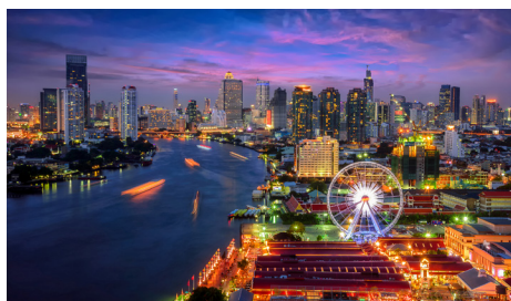
ASIA 17 - 18 May Bangkok, Thailand