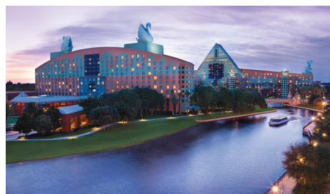
NORTH AMERICA 12 - 14 September Orlando, FL