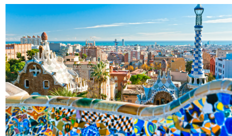
EUROPE 24 - 26 October Barcelona, Spain