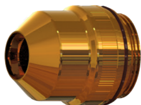
Shield Cap 90-0747

Plasma gas inlet: 120psi/8.4bar Shield gas inlet: 120PSI/8.4bar