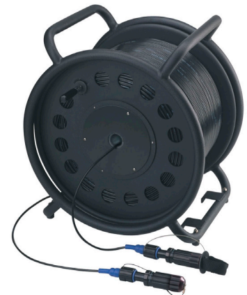
There is no better reel in the broadcast industry than OX-Frame Reels. Available only with Belden TAC fiber assemblies, not sold separately.

For more information on Belden Tactical Fiber bulk cable and assemblies visit info.belden.com/assembly-configurators