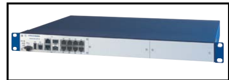
MACH102 8TP (shown)