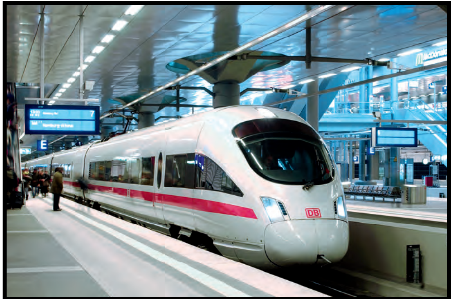
OCTOPUS switches are part of the passenger information systems in modern trains