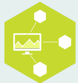
List of tracking

1 Share your media plan (complete MobileXCo media tracking template)