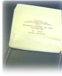
BCR-126A; lead crystal glass