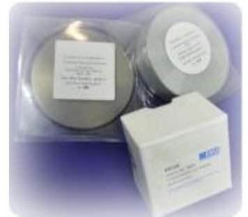
BCR-288, BCR-326, BCR-327, BCR-355 and ERM-EB325; metals discs