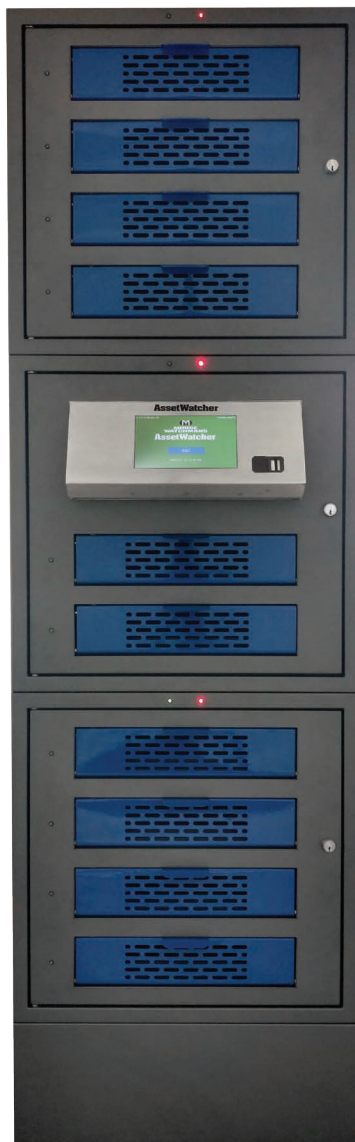
10 Locker Main Stack

AssetWatcher takes storage into the modern era. Built-in RFID technology enables you to recognize and track assets that have been placed in or removed from lockers. With the ability to support over 10,000 users, AssetWatcher tracks who removed or returned each asset and when it happened. Optional USB charging feature adds a USB port inside each locker so devices can be charged while they are safely locked away, and a biometric scanner lets users unlock assets with the scan of a finger. Three modes enable administrators to tailor use of AssetWatcher to specific needs. Perfect for hotels, schools, hospitals, casinos, and other high-security applications, AssetWatcher's flexibility and scalability make it ideal for a range of uses.