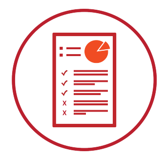
Identify Areas of Improvement