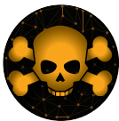
Fighting Internet Piracy