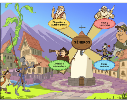
Istation Español is growing its curriculum! Lectura Avanzada is introducing students to the essential features of fiction and nonfiction genres. As students explore the Past Land (Pasado), they will experience two new genre lessons: Myths & Legends and Informative Articles.