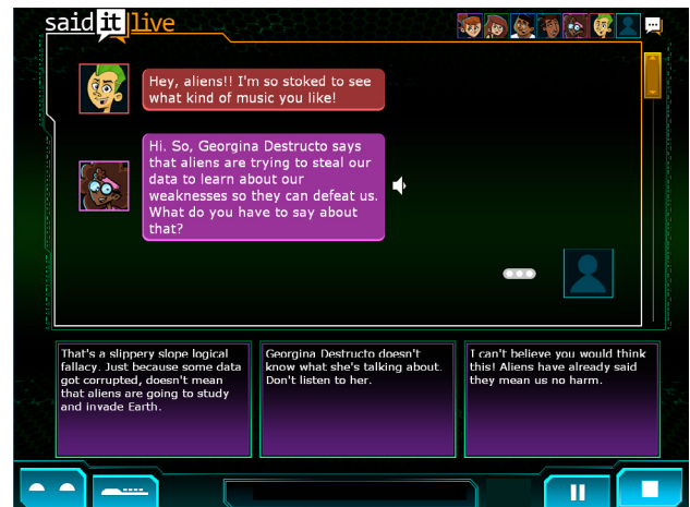
Students use their rhetoric skills to convince the Hubsters that voting to remove the firewall is the right choice during the Said-It Live AMA event.