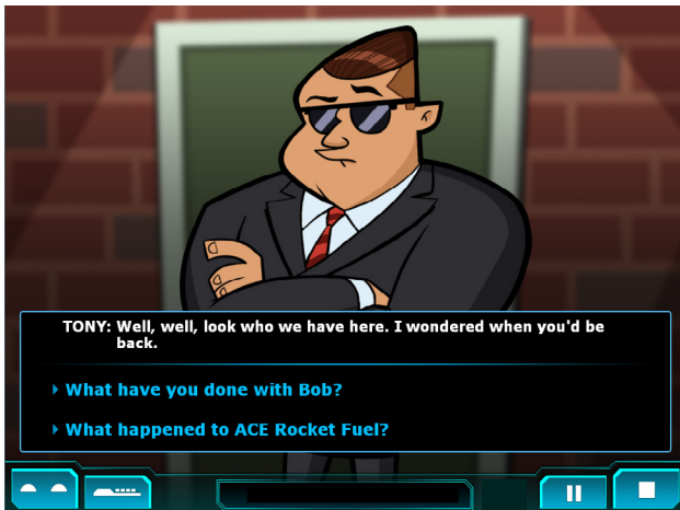
In the Hub, Tony the Bouncer has moved Bob to a secure location. It's up to students to convince Tony to release Bob using the rhetoric they picked up in the last level.