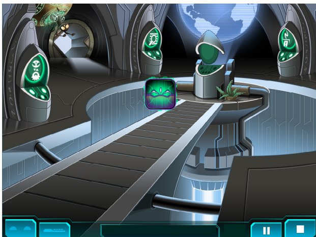
Once students gather missing data and unscramble the Decoder, they head to the alien Virtual World with SAGE to learn more about argumentative structure, idioms, and logical fallacies.