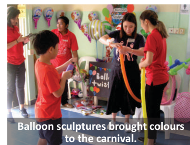
Balloon sculptures brought colours to the carnival.

Pre-school By-The-Park (PBTP) Fundraising Family Carnival.