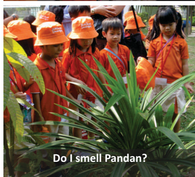
Do I smell Pandan?

LF Centennial Pte Ltd making mooncake and sharing the joy of the Lantern Festival with our residents.