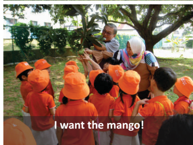
I want the mango!