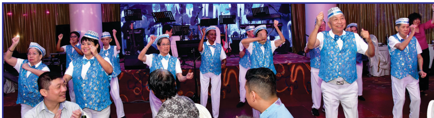
Supported by three volunteers, ten residents showcased their dance movements.