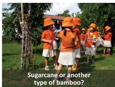
Sugarcane or another type of bamboo?

My First Skool getting to know the trees and plants in our compound.