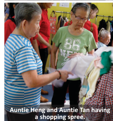
Auntie Heng and Auntie Tan having a shopping spree.