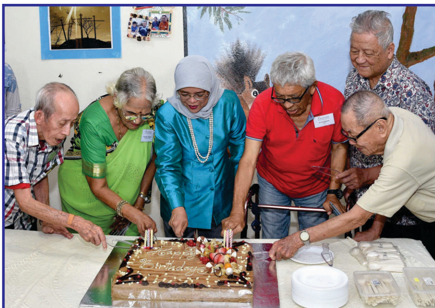
President Halimah joining in the birthday celebration for residents born in September.