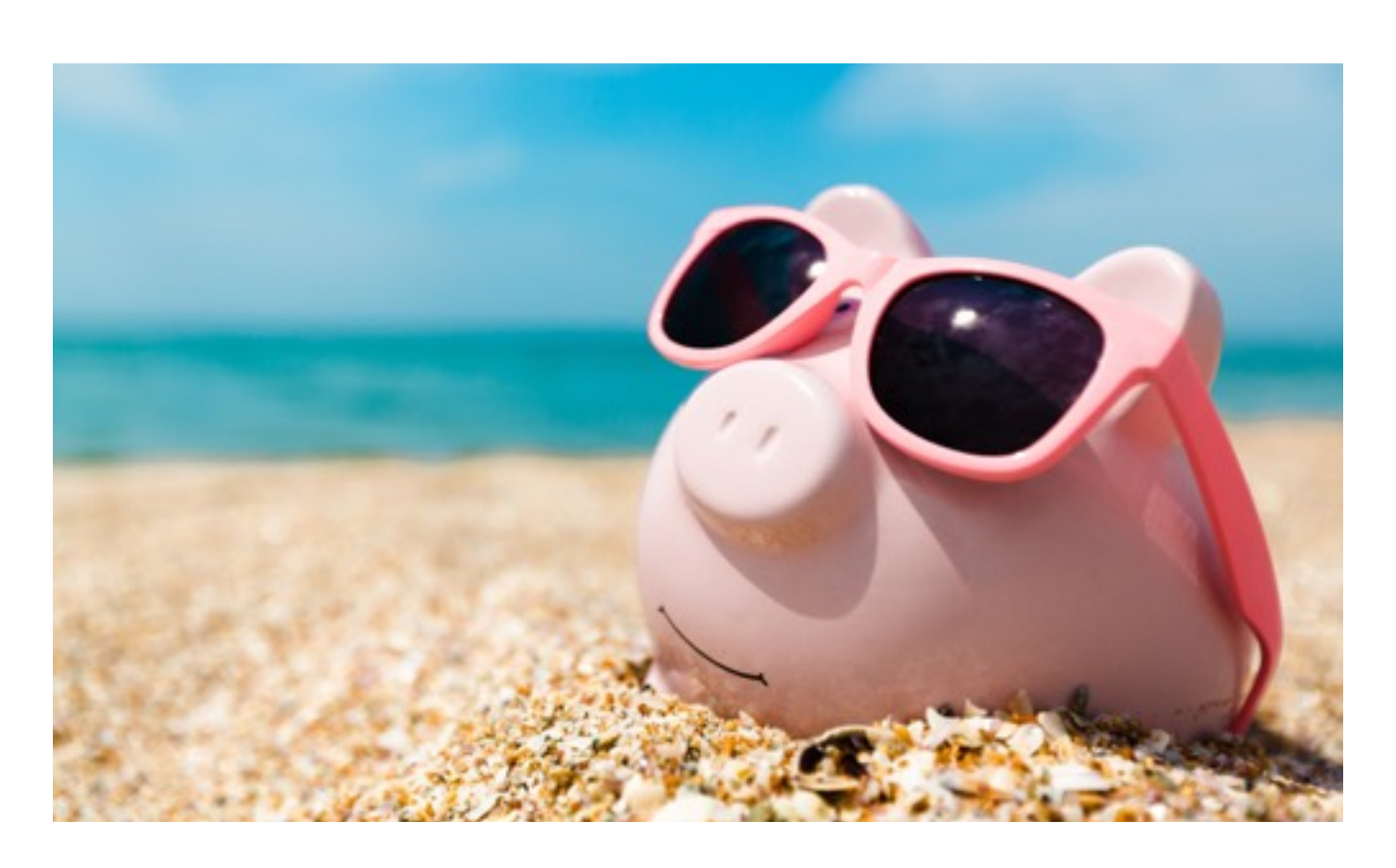
Need help financing your vacation? Ask Wasatch Peaks Credit Union about our vacation loans, and vacation club accounts!

http://expertvagabond.com/common-travel-scams/